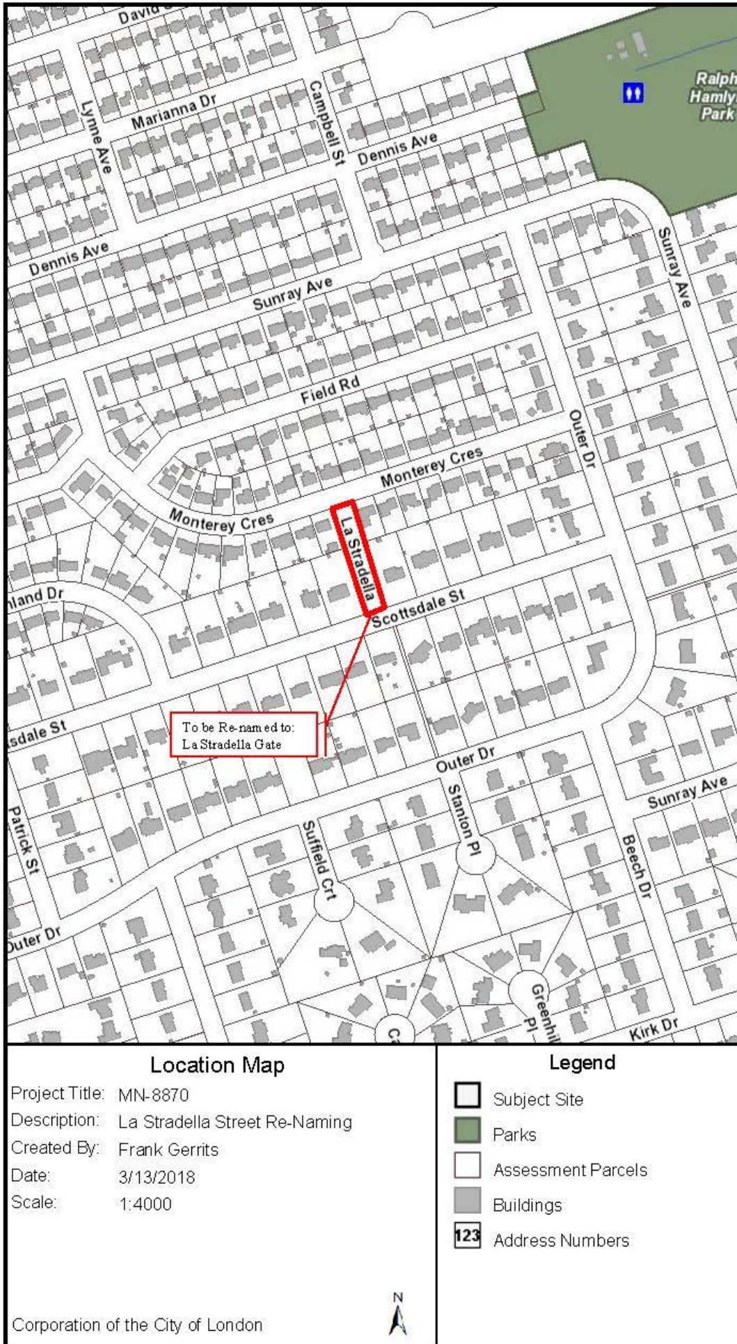
Figure 1: Illustrates the portion of La Stradella which is to be renamed to La Stradella Gate.