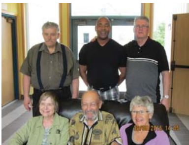
Visit to Dresden