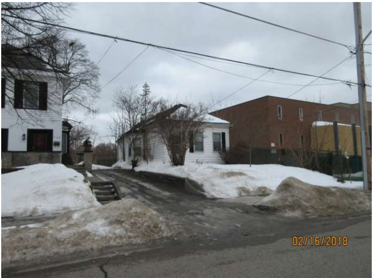
Image 2: View looking northwest of the property at 491 English Street. Note former Lorne Avenue Public School building at 723 Lorne Avenue in the background.