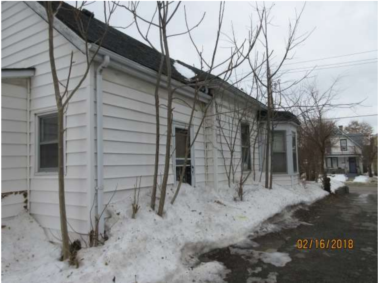
Image 5: South façade of the building at 491 English Street, looking east.