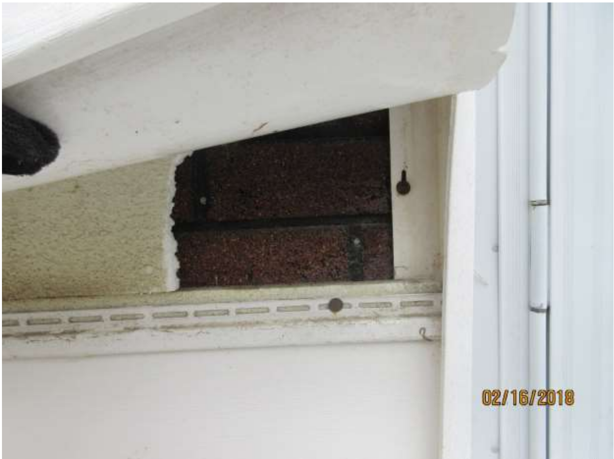
Image 6: Detail showing insul-brick cladding underneath vinyl siding of building at 491 English Street.