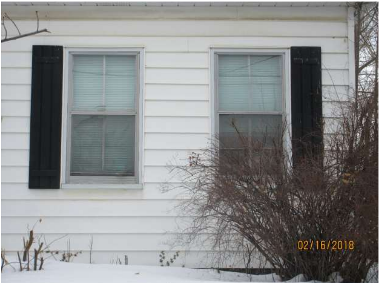
Image 4: Detail of the front windows of the building located at 491 English Street.