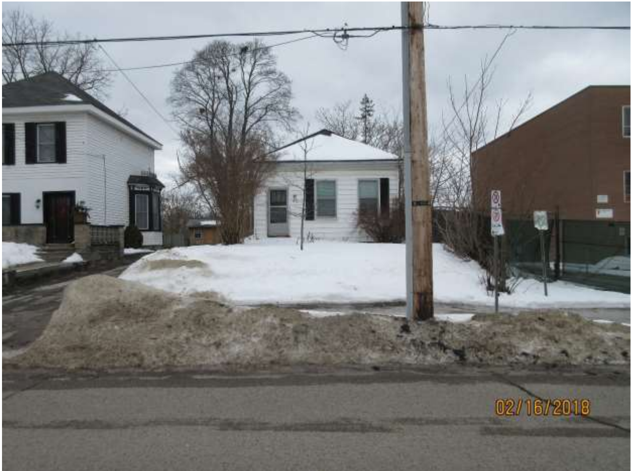
Image 1: View of front (east) façade of the building located at 491 English Street.