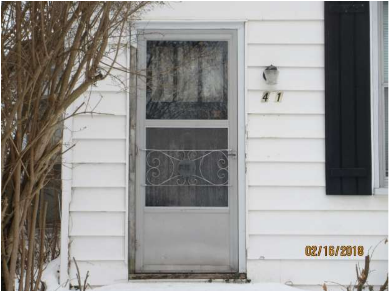
Image 3: Detail of the front door of the building located at 491 English Street.