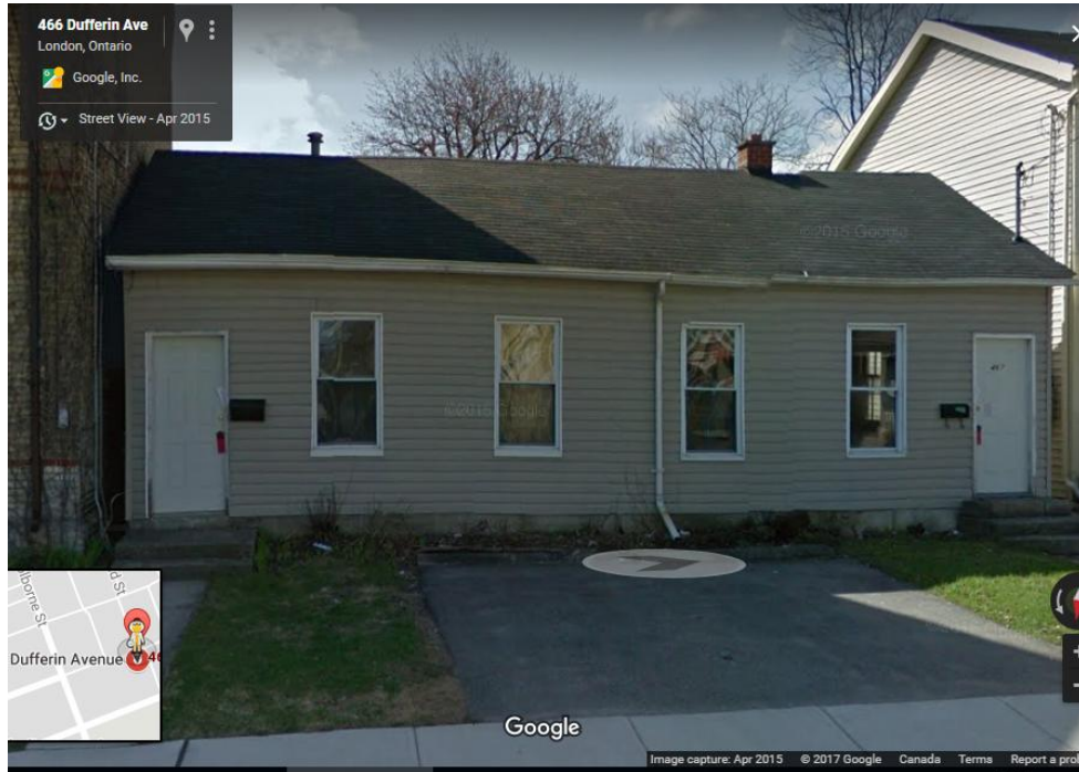
467-469 Dufferin Avenue – April 2015