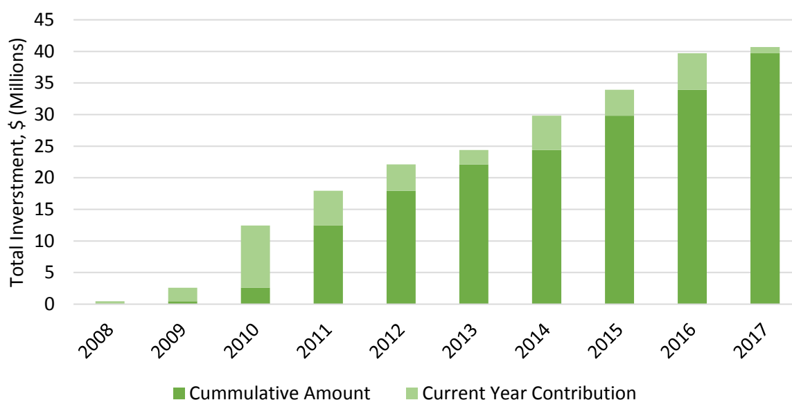
Figure B1: Level of investment for combined sewer separation and SSO mitigation from 2008 to 2017