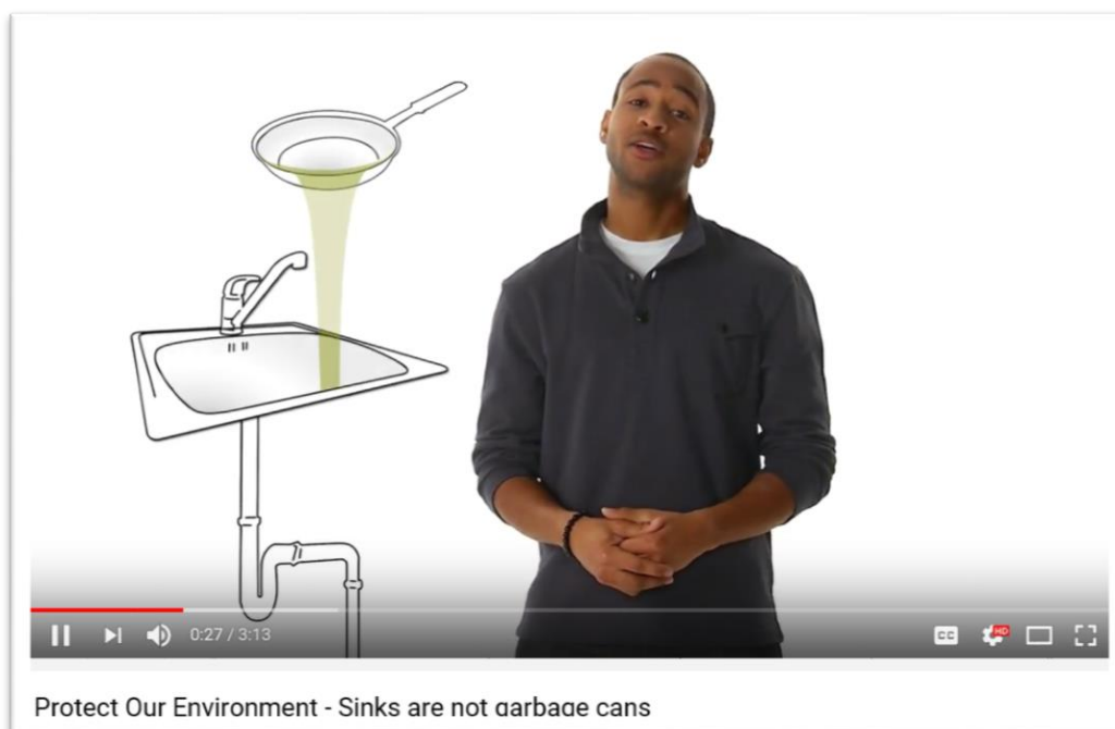
Figure 3: Public Information Video "Sinks are Not Garbage Cans"

Similar to the first featured video, the "Sinks are Not Garbage Cans" information video highlights the importance of not disposing of waste (i.e., fats, oils, grease, etc.) down sinks. Proper disposal of these household wastes helps to prevent/ avoid clogging of pipes and sewers.