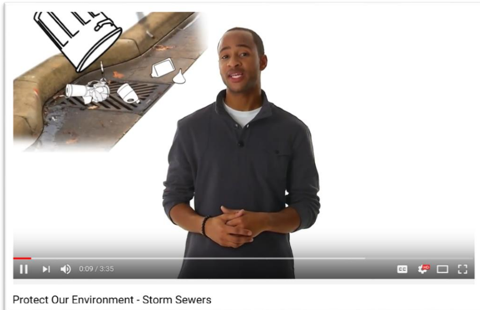
Figure 4: Public Information Video "Storm Sewers"