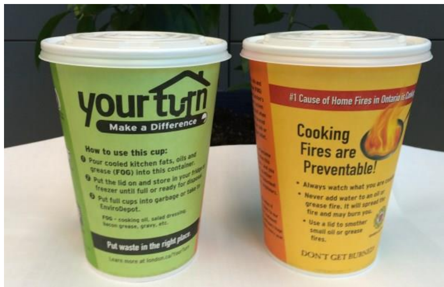
Figure 1: "Your Turn" cups for household cooking oils and fats

Fats, oils and grease (FOG) cause London's sewer system major grief when they are poured down the sink or toilet. Sewers can become blocked when this FOG hardens. Backups can then occur which can lead to basement flooding. The City of London developed the "Your Turn" pollution prevention pilot project which encourages property owners to pour FOG waste into a supplied biodegradable cup, as shown below, to harden and then dispose of in their solid waste collections.