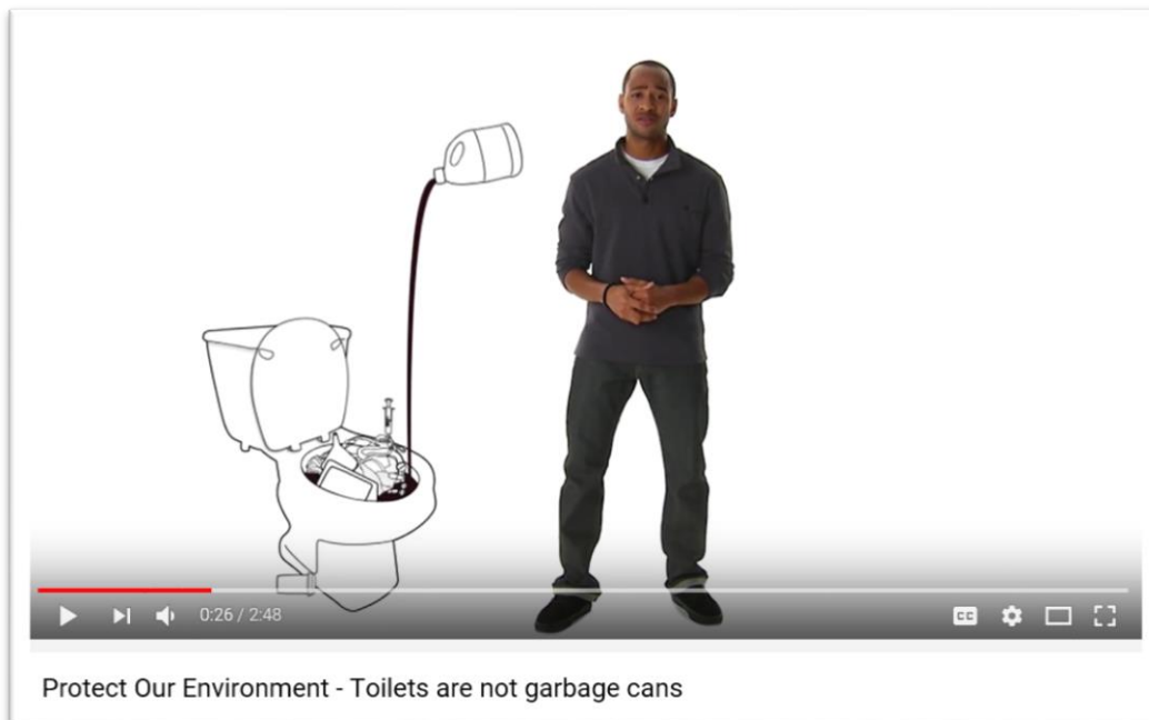
Figure 2: Public Outreach Information Video "Toilets are Not Garbage Cans"

The first video in the Protect Our Environment series explains why toilets are not the place to dump wipes, personal hygiene products, food, medicine, solvents, etc., and explain the consequences of improper disposal. The video also highlights proper disposal methods.