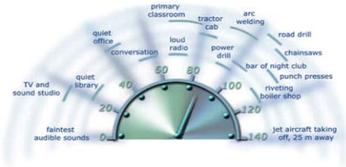
Figure 2 EXPONENTIAL SOUND AND HEARING LOSS

Canadian Standards Association Z94.2-02: Hearing Protection Devices Performance, Selection, Care, and User - Table Equivalent Noise Exposures