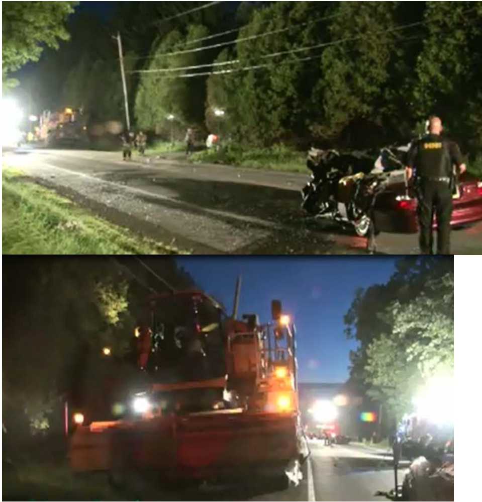
Fig 4 Scene of accident when a car ran into the front of a pea harvester

On behalf of Bonduelle and all the local farmers in this area we urge you to accept our request to add Stop Lights at Glanworth drive so our equipment can pass safely across the road ways.