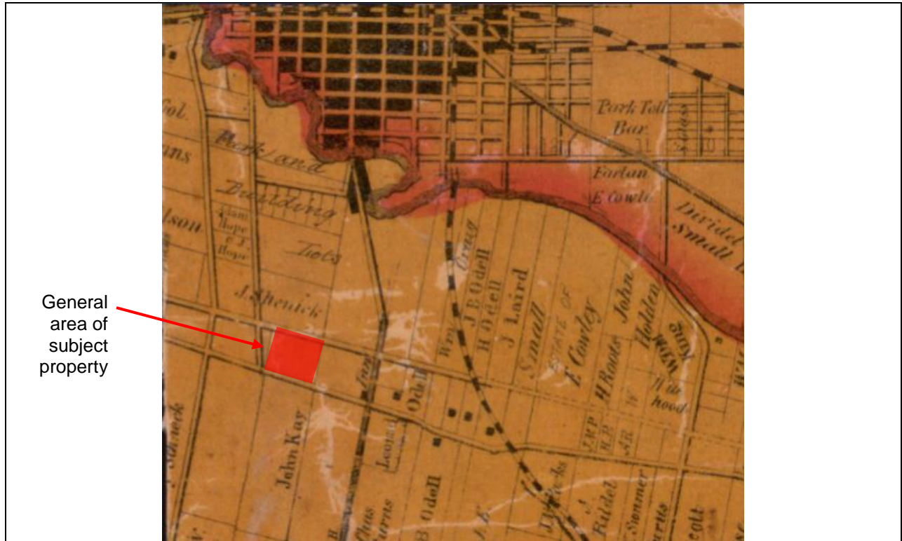
Image 1: Tremaines' Map of the County of Middlesex (1862), partial