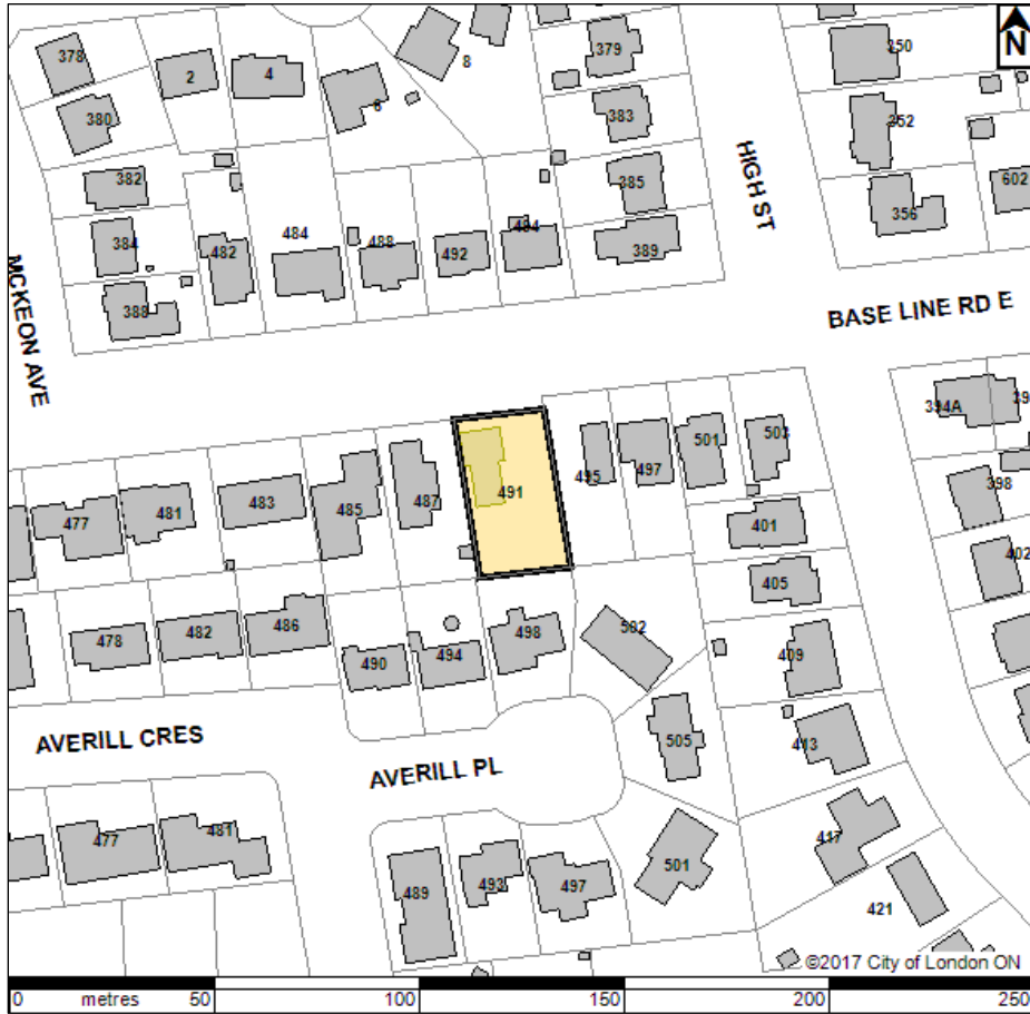
Map 1: Property location of 491 Base Line Road East