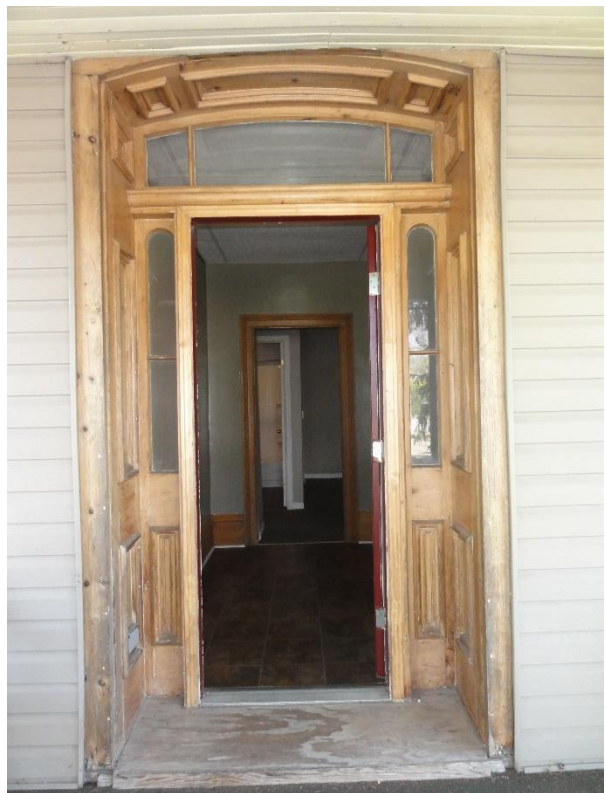
Image 14: Original decorative wood panelled front door alcove and surround