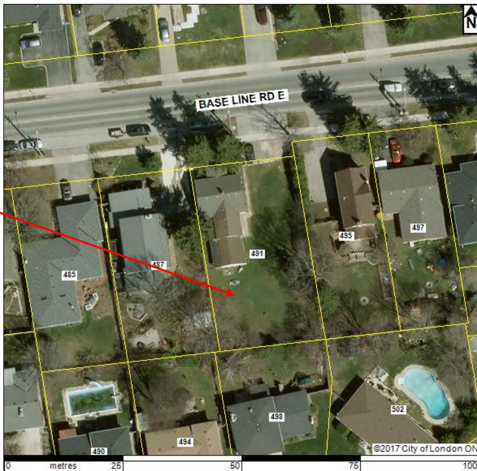
Map 2: Aerial image of 491 Base Line Road East