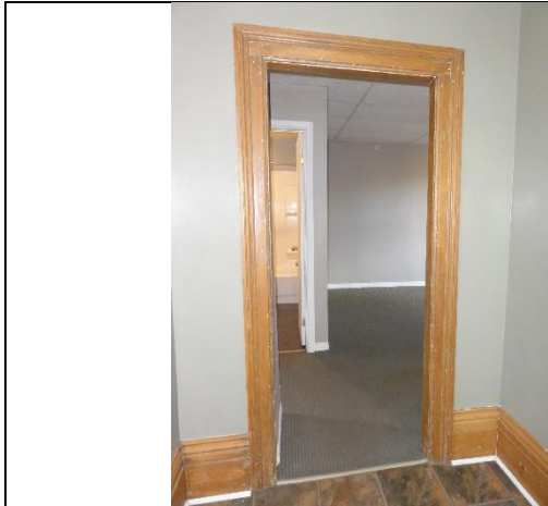
Image 7: Interior view of showing contemporary upgrades – carpeting and suspended ceilings