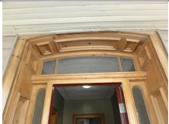
Image 10: Original decorative wood panelled front door alcove, surround and transom