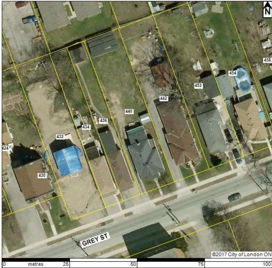
Map 2: Aerial image of 440 Grey Street