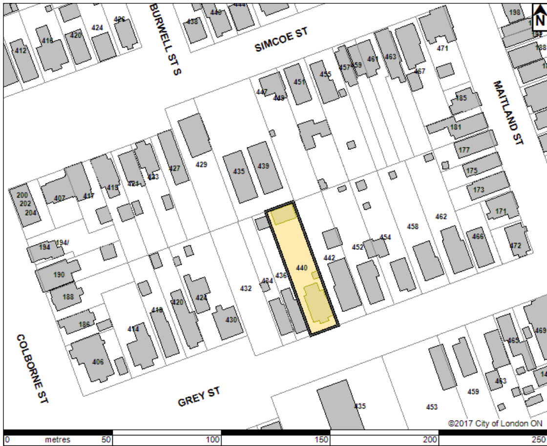
Map 1: Property location of 440 Grey Street