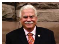
Percy Hatfield MPP for Windsor-Tecumseh, NDP