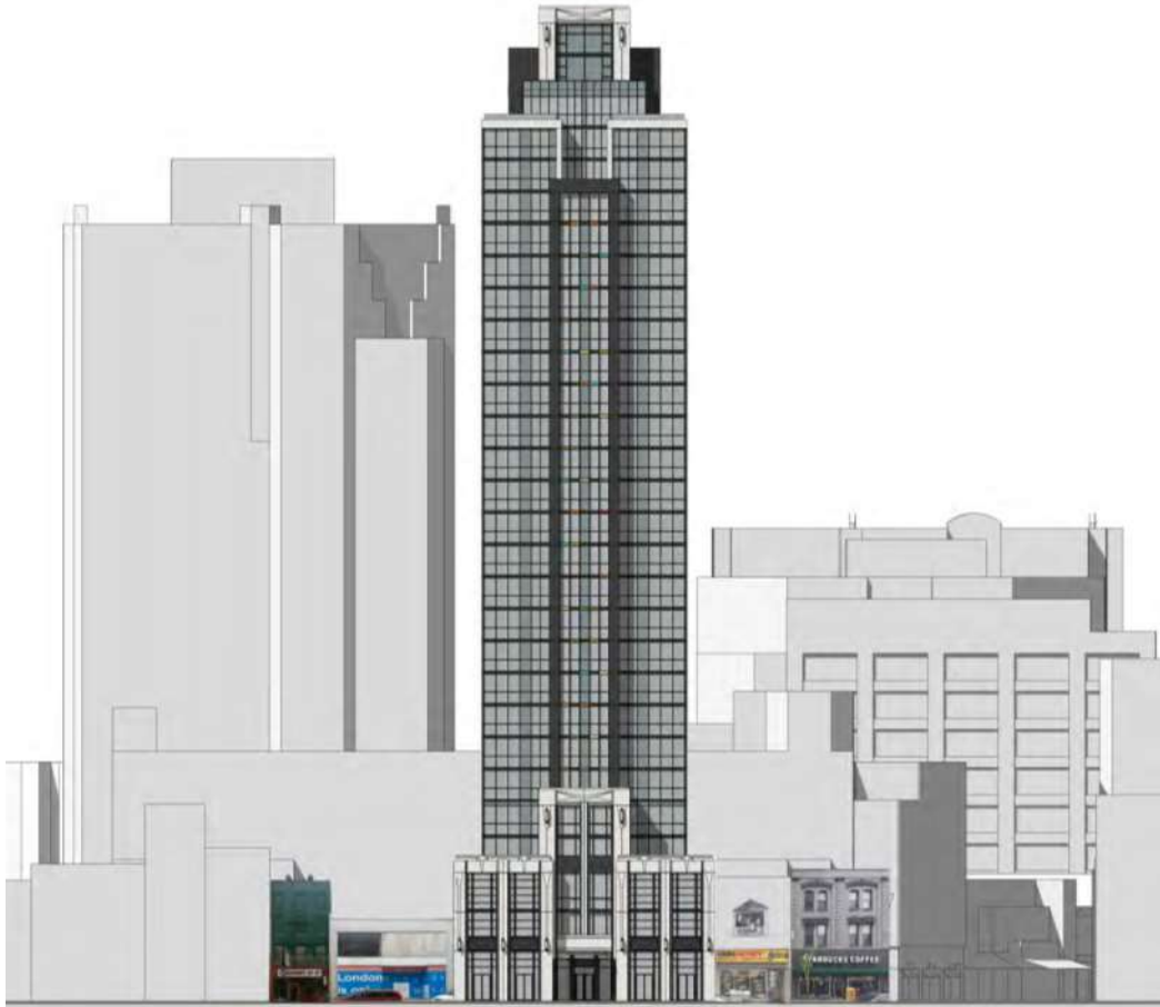
Above: South Elevation — Dundas Street