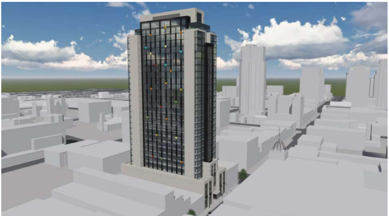
Below: 3D Perspective