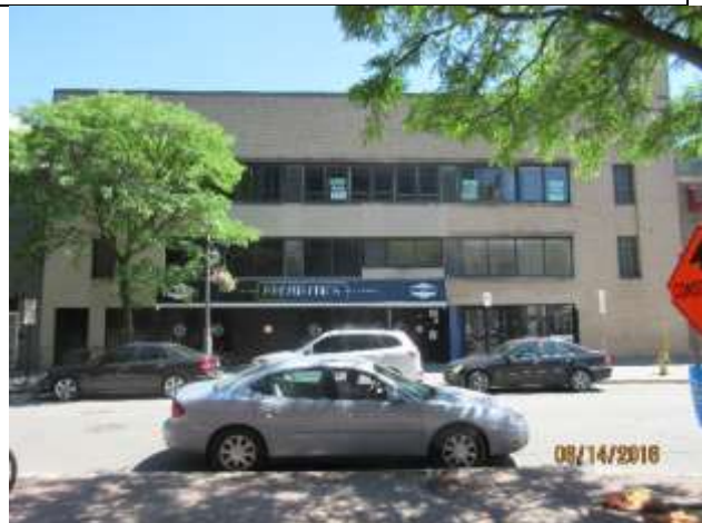
Image 3: 153 Carling Street, 2016