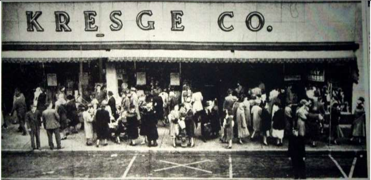
Image 1: Opening of Kresge's, 1948 ( The London Free Press , November 3, 1948)