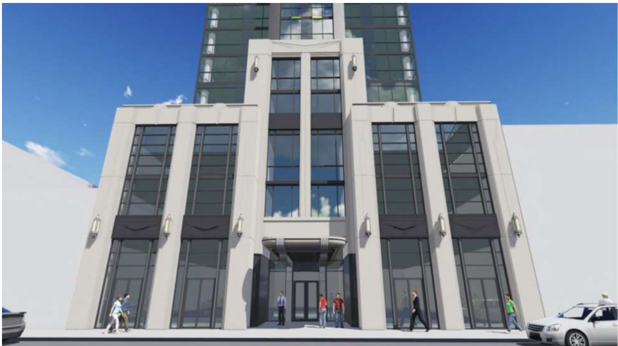
Below: 3D Perspective, Street Level — South Elevation, Dundas Street