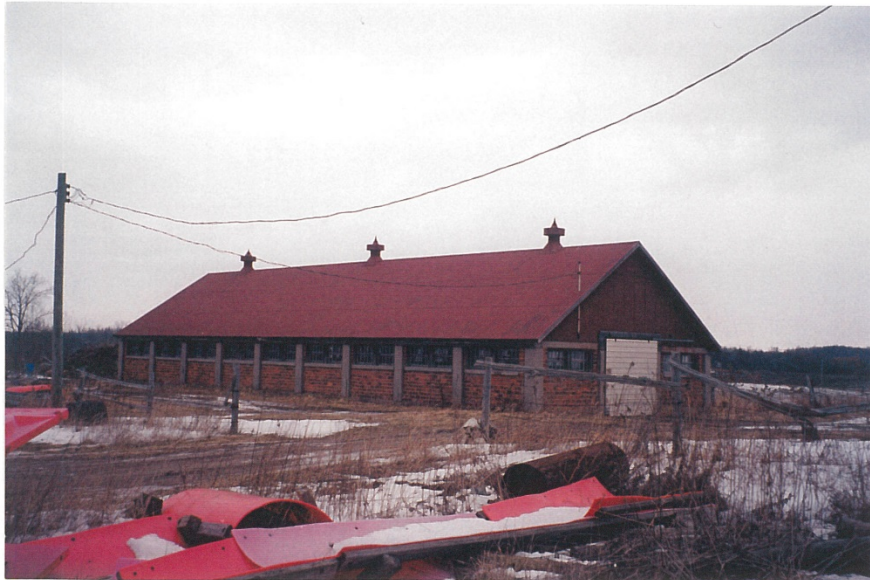
Figure 9: Northwest Building, 660 Sunningdale Road East