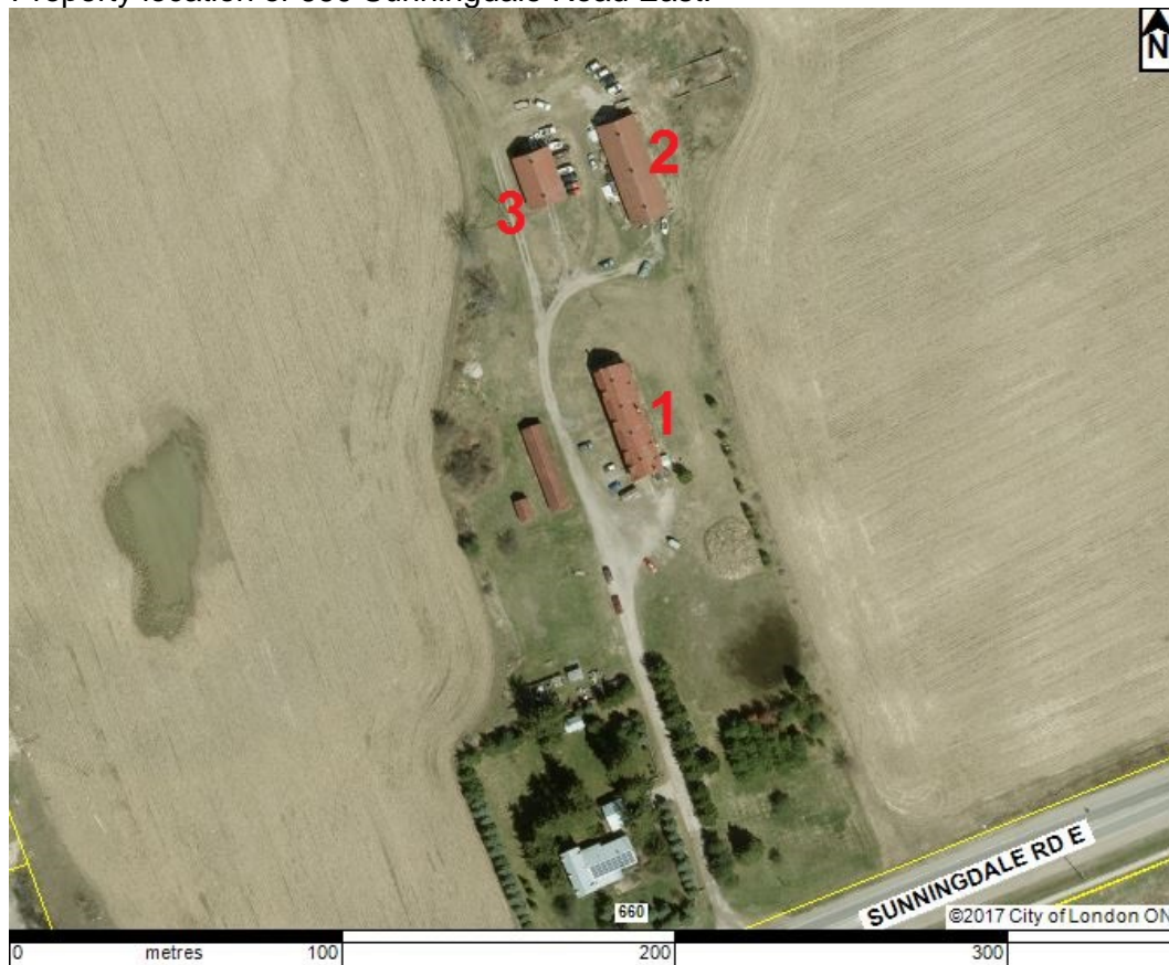
Map 2: Detail of the property located at 660 Sunningdale Road East identifying Barn 1, Barn 2, and Barn 3.