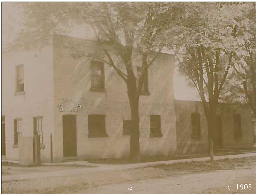
This is the former Kent Brewery, on Ann Street, established in 1859.