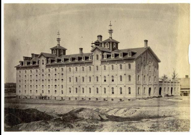
Carling Brewery - Talbot St & Anne St c. 1874–1876