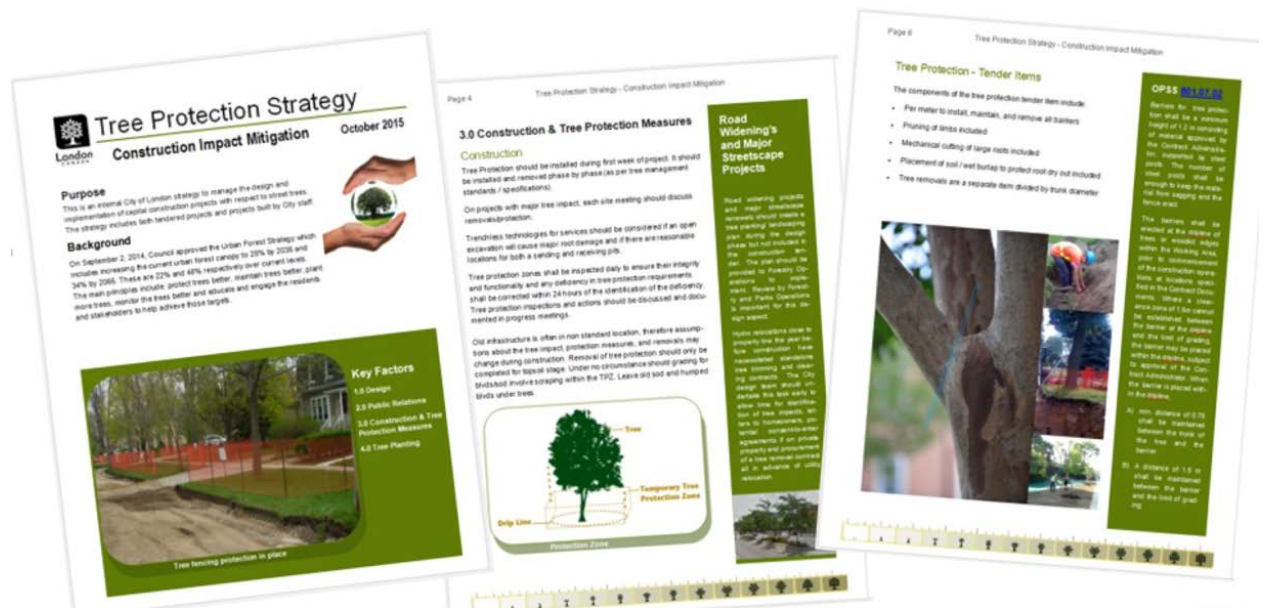
Figure 5 - City of London EESD Tree Protection Strategy