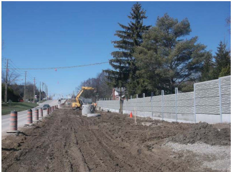
Figure 1 - Sarnia Road

The 2016 construction season was very busy overall and the City was able to deliver on our commitment of building better roads for London residents and visitors. The completion of these significant projects are a large part of the City's ongoing commitment to