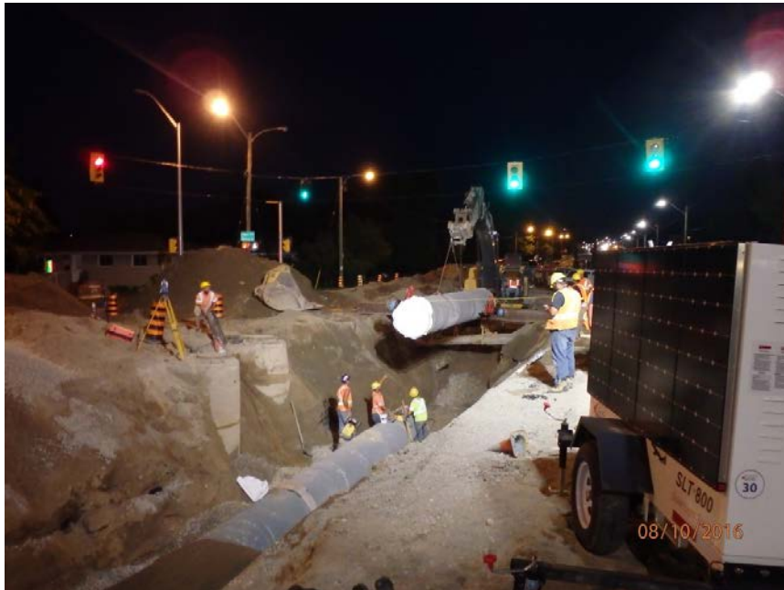
Figure 6 - Commissioners Road

The City does receive complaints about absent work zones and lack of construction activity. While it may appear at times that little work is being completed, scheduling may be required by the contractor to ensure all work is completed in a coordinated fashion given the complexity of the work, number of subcontractors and other external utility providers. The required work must be completed in the proper sequence and must be finished prior to lane shifts, starting another phase or moving on to the next critical path operation.