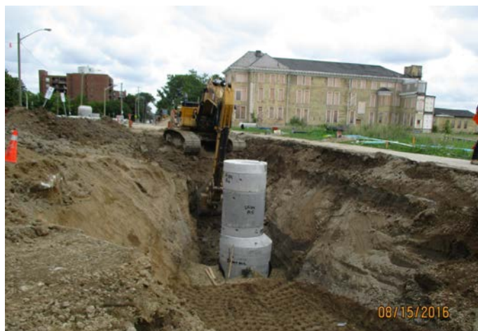
Figure 2 - South Street

A number of large construction projects were identified to Council in March 2016 and scheduled for implementation in 2016. Figure 3 provides an overview of major projects that were projected to have an impact on traffic flows across the City noting extensive coordination was carried out at project and program levels to reduce these impacts.