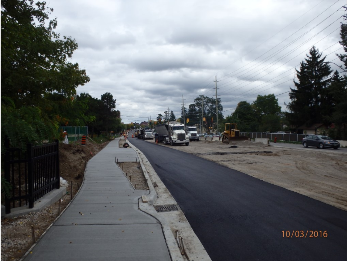
Figure 7 - Commissioners Road

The City of London has taken steps for both immediate and long-term benefits to road integrity and have implemented a strong plan to strengthen asphalt requirements that ensures value for money, enhances oversight and improves asphalt pavement quality for London's roads.