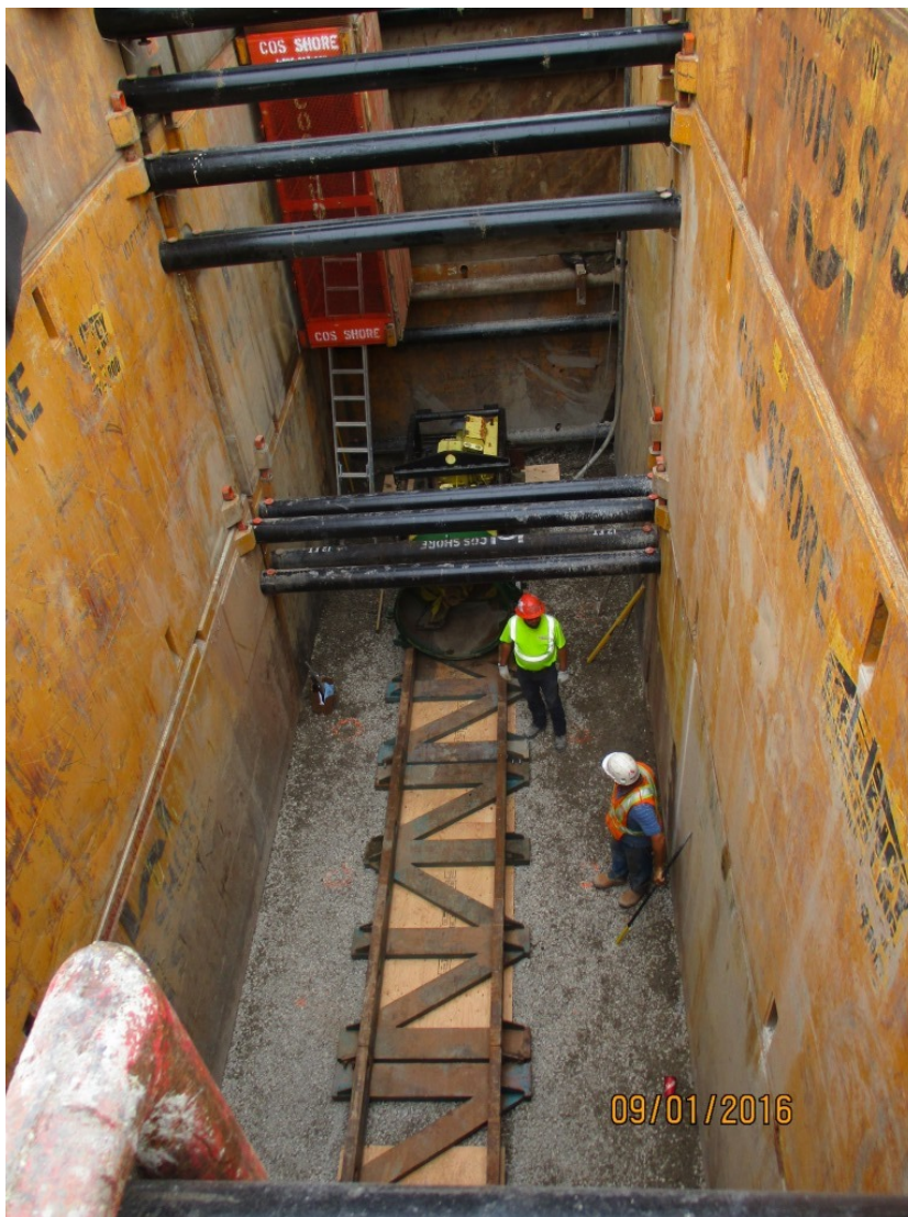
Figure 4 - Campbell St.

In order to overcome technical challenges and to minimize disruption to the public, projects often employ specialized sub-contractors to perform certain aspects of the work, such as trenchless work around railway tracks. Consideration on future projects will be given to awarding higher risk specialized work as a separate contract. Allowing for a separate contract will minimize the trickle-down schedule and budget impacts that can occur when a specialized sub-contractor's work is delayed.