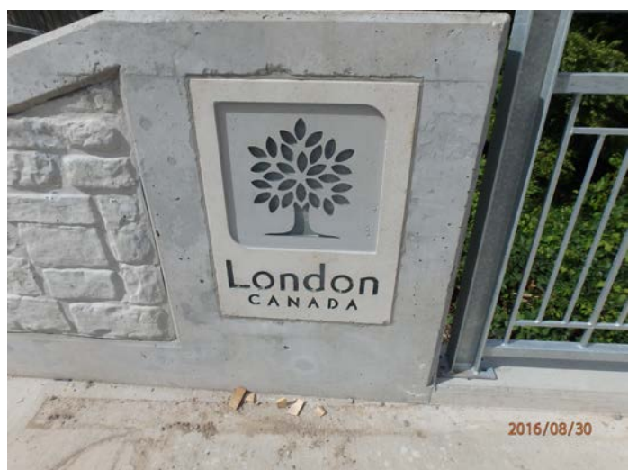
Figure 9 – Stoney Creek Bridge

Lessons learned, strategies that may be adapted and procedures that can be improved have been identified and will be applied to 2017 construction projects where possible. Under a continuous improvement program, the public opinion on City construction projects has risen since post construction surveys were started in 2004. Opportunities for the collection and utilization of lessons learned have been in all phases of a project life cycle. The early integration of construction knowledge into all phases of a project can be improved by effective use of lessons learned as well.