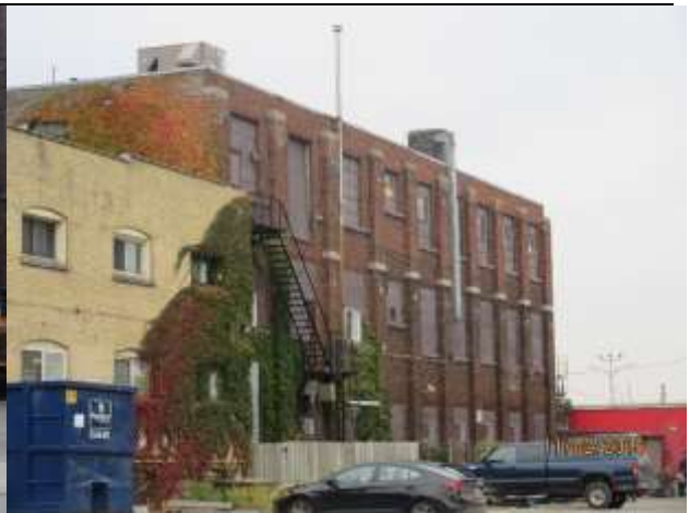
Image 2: 341 Ridout Street North (former Teasdale Hosiery/Richmond Hosiery).