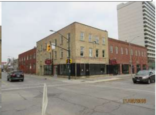
Image 6: 359 Ridout Street North (former McFarlane Hotel/Grand Central Hotel).