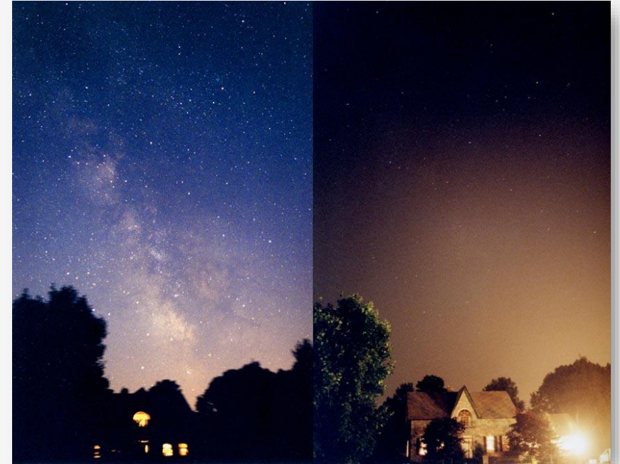
The night sky in Toronto, Ontario during a power outage in 2003 (left) and on a night with power (right).