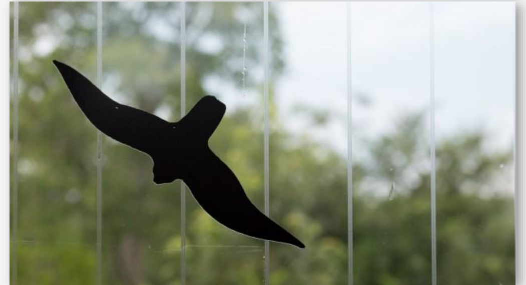
A window with visual marker stripes and a bird decal to prevent bird strikes

Art work applied to the interior or exterior of windows can be used to provide sufficient visual markers while allowing for natural light.