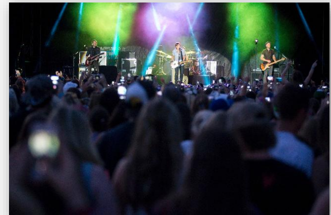
Keith Urban at Rock the Park music festival, London Ontario.

An exemption may be granted in whole or in part with terms and conditions. Any breach by the applicant of any of the terms or conditions will render the exemption null and void.