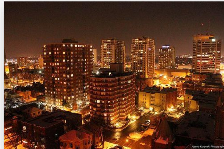
London, Ontario downtown at night.