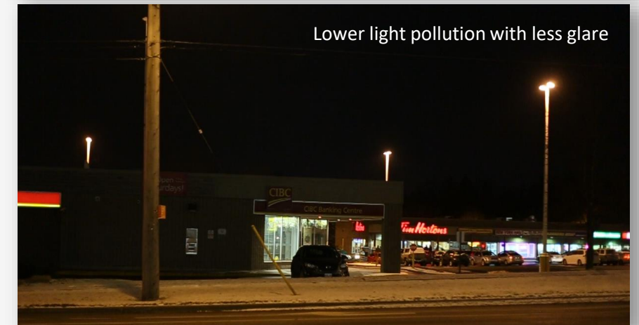
Two commercial lots in London, Ontario with excessive light pollution and glare (top) and relatively low light pollution and low glare (below).