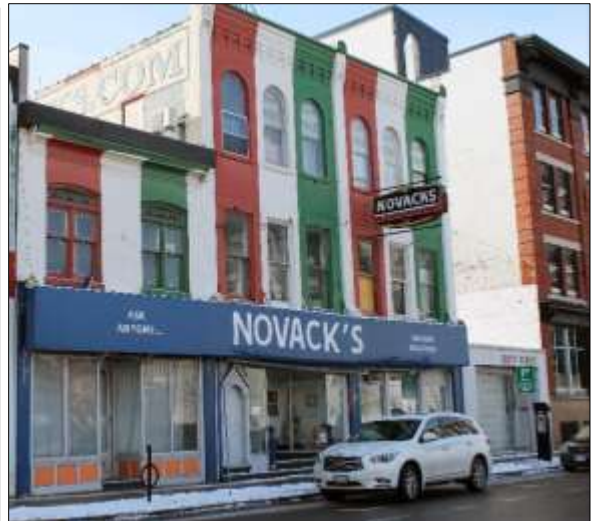
Location Map & Photograph of 211-213 King Street (former Novack’s Building)