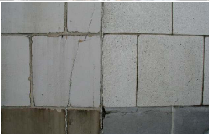
1960s cladding (below)