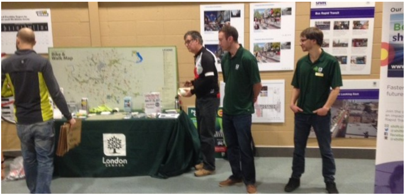
The most popular item was the Bike & Walk map. People sought out the City's display just to get a map.