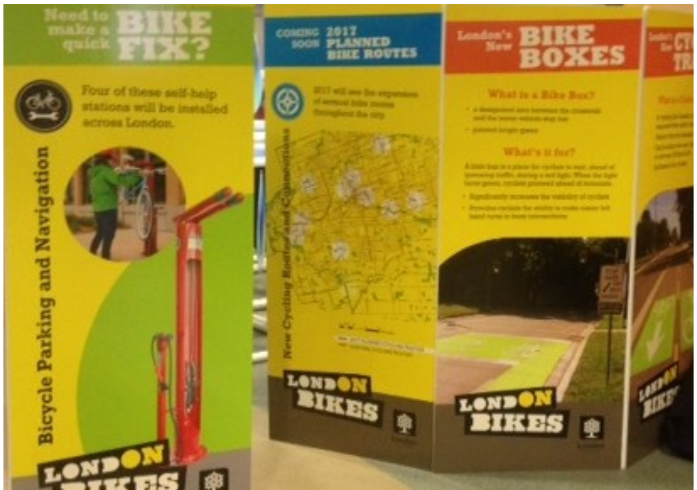
Many of City Staff Transportation department were on hand to answer questions about the proposed connection from Richmond to Adelaide, Shift, and Dundas Place.