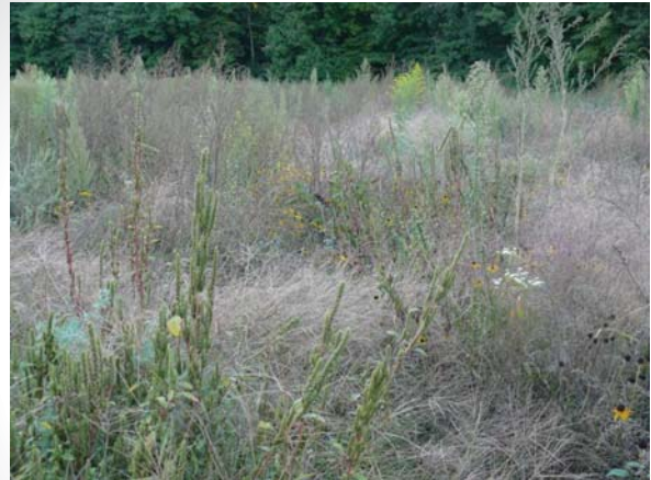
St. Williams NURSERY & ECOLOGY CENTRE