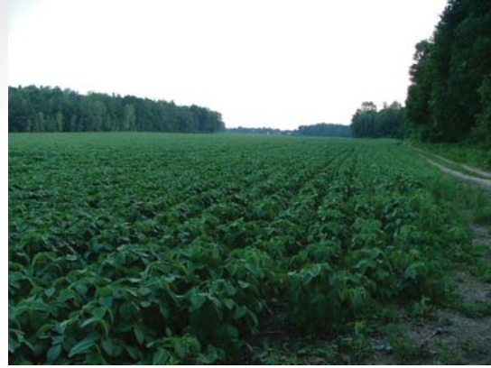
St. Williams NURSERY & ECOLOGY CENTRE