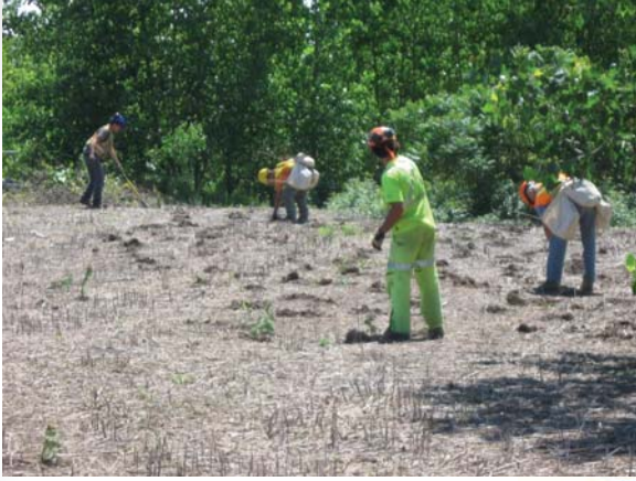
St. Williams NURSERY & ECOLOGY CENTRE