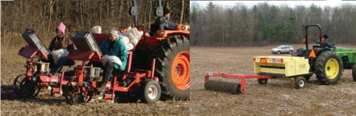
St. Williams NURSERY & ECOLOGY CENTRE