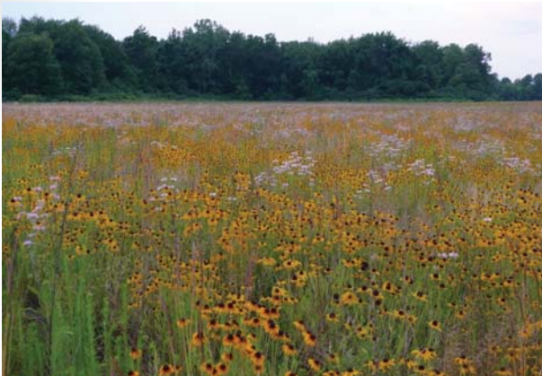
St. Williams NURSERY & ECOLOGY CENTRE