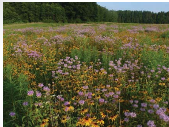
St. Williams NURSERY & ECOLOGY CENTRE