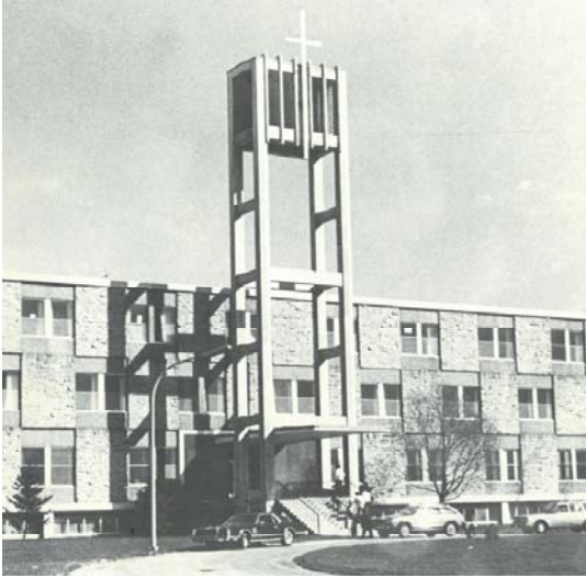
Original entry bell tower demolished 2011