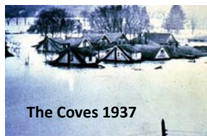
The Coves 1937

Planning and Environment Committee Presentation: September 2016