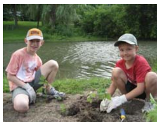
Planning and Environment Committee Presentation: September 2016

Successful 70 year history of working with 34 partner municipalities for effective watershed management .