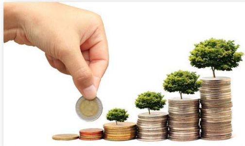
Planning and Environment Committee Presentation: September 2016

Capital assets valued at well over $100 million