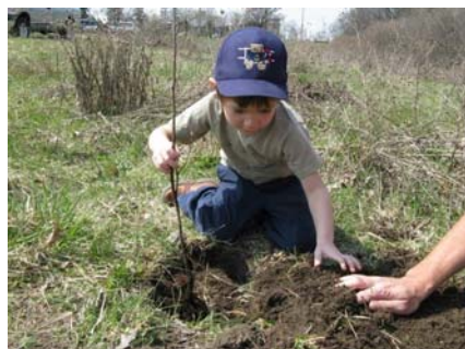
Planning and Environment Committee Presentation: September 2016

Note: Percent natural land cover is no longer increasing . Community planting efforts are simply maintaining the status quo.