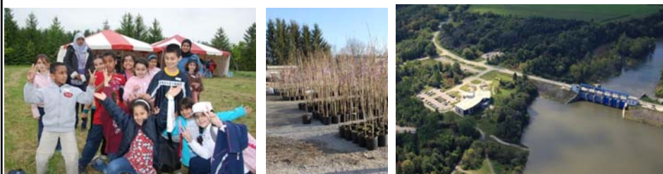
Planning and Environment Committee Presentation: September 2016