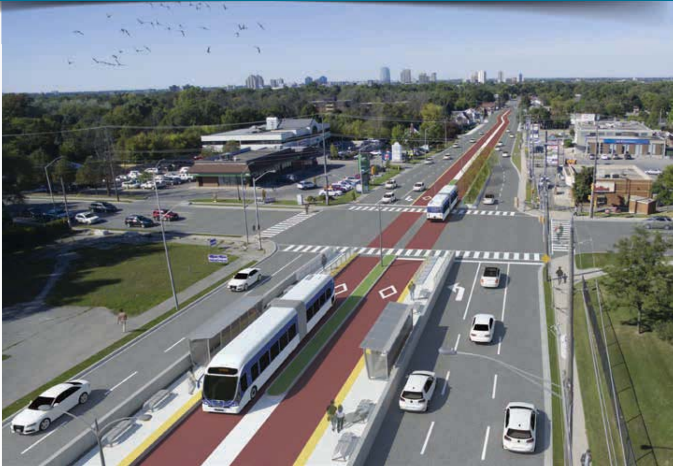
City of London: Shift.

Despite these challenges, some Southwestern Ontario cities are engaged in projects that will boost urban transit's role as a component of the public transportation system on a regional basis.