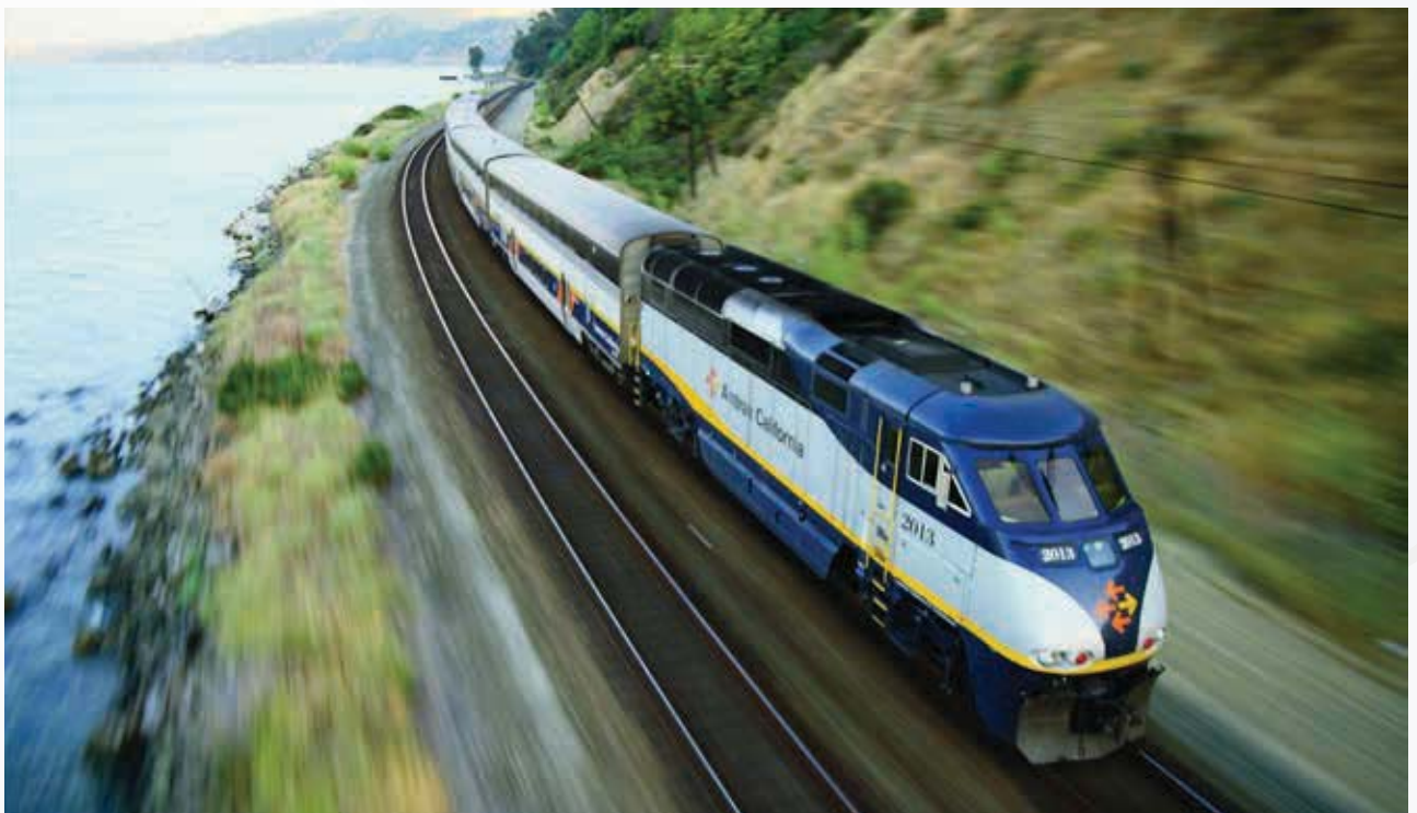
There are currently six high-performance rail corridors in the U.S. and more than a dozen are under development.

With the federal government now reviewing its rail passenger options, and the provincial government studying a potential Toronto-London-Windsor HSR line, the opportunity exists for HPR to be analyzed and considered for Southwestern Ontario.