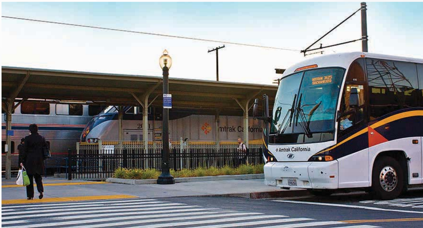
The partnership approach provides travellers with direct connections between intercity trains, inter-community buses and local transit in many California communities.

In Southwestern Ontario, some of the pieces of the public transportation puzzle are already in place, but they require innovative development. Others are still absent.