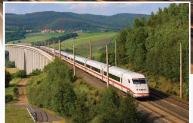
German 280-km/h Inter-City Express high-speed train