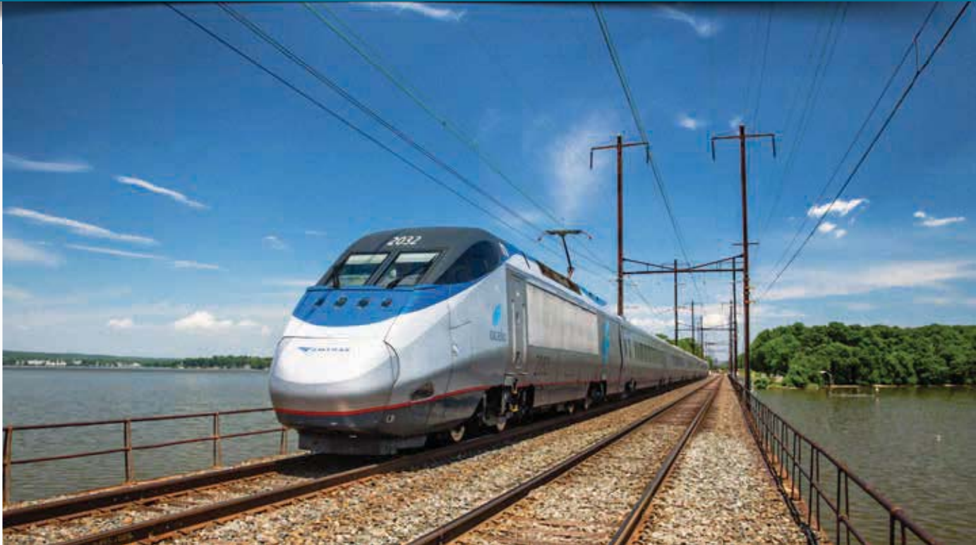
Bombardier's 240-km/h Acela Express on Amtrak's Northeast Corridor.

HSR has been studied numerous times since the 1970s for possible application to all or portions of the Quebec-Windsor Corridor. Each study determined it was technically feasible and could yield mobility benefits, but it would require substantial public funding and would likely attract only limited private-sector investment.