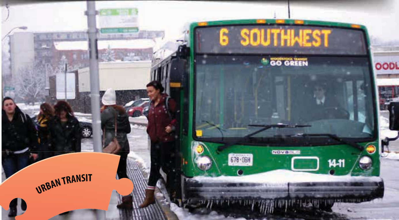
Woodstock Transit.

Advancing Southwestern Ontario's Public Transportation Opportunities