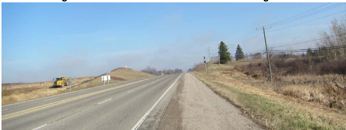
Figure 1: Site Photo – Richmond Street Looking North

The study objectives defined the need to: