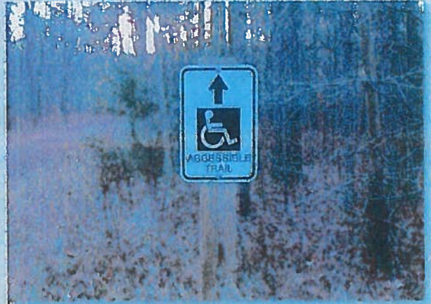
Photo 2.2.5.1 Trail Signage

York Region developed and manages a recreation trail system at the Hollidge Tract in the York Region Forest. The trail system is a public facility which incorporates a variety of trails and related parking facilities, including a one-kilometer long accessible trail configured as a loop.