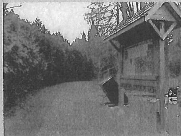
Photo 2.2.5.3 Trail Head Information

100% of the trail is Firm or better 1100m (3612 ft) of the trail is Firm