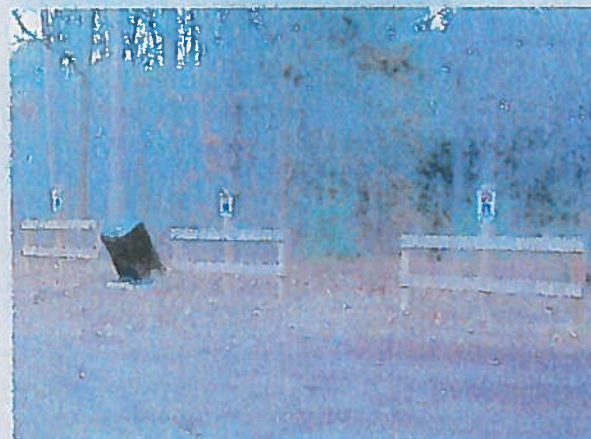
Photo 2.2.5.6 Accessible Parking at Trail Head