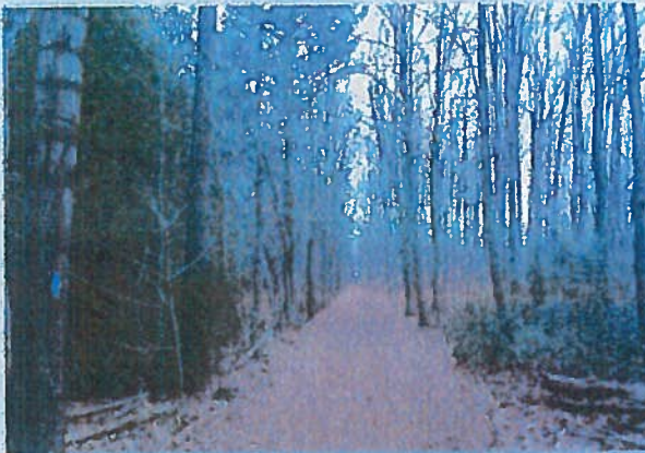
Photo 2.2.5.4 Accessible Trail