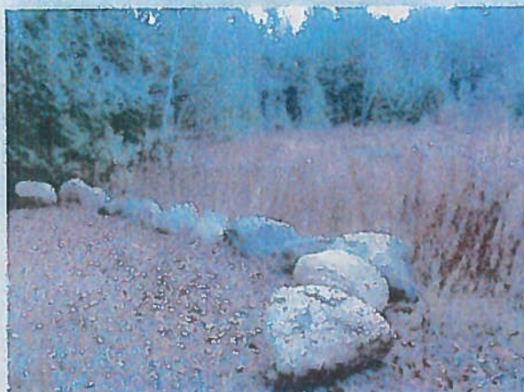
Photo 2.2.5.5 Edge Protection at Trail Outlook