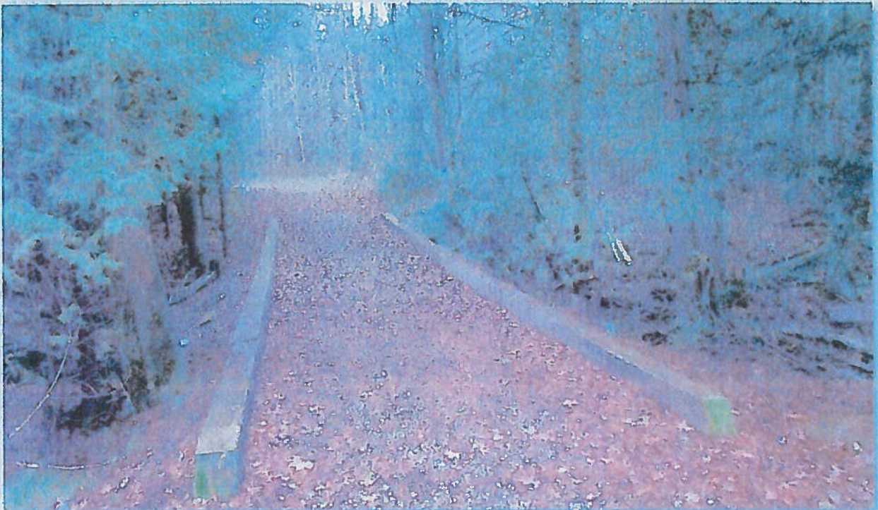
Photo 2.2.5.2 Edge Protection at Trail