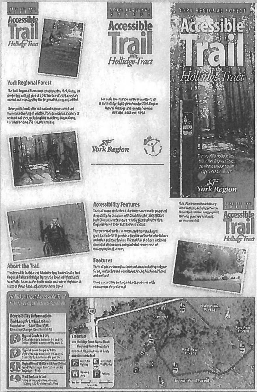
Figure 2.2.5.3 Trail Brochure

York Region also published a brochure which illustrates the trail configuration and its characteristic, as well as the accessibility features that users can expect to encounter.