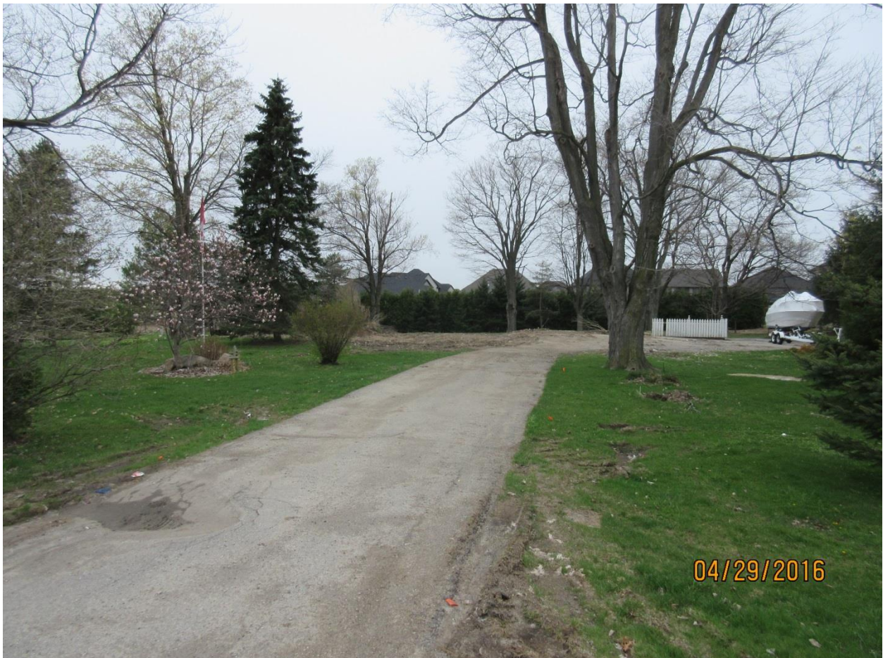
Image 2: 3557 Colonel Talbot Road. Note: the dwelling formerly located at this address burnt on February 23, 2016 and was subsequently demolished.