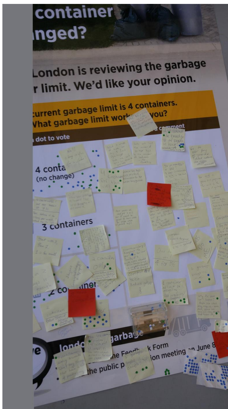
Figure A2 (updated): Display at Canada Games Aquatic Centre