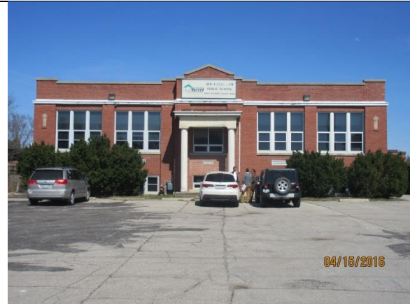
Image 1: Former M. B. McEachren Public School located at 4402 Colonel Talbot Road.