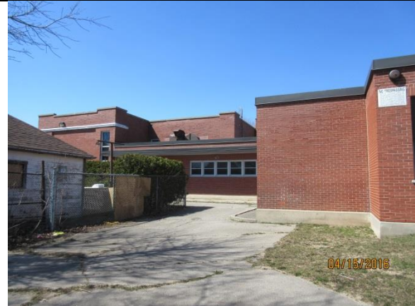
Image 3: View showing south façade of 1925 school with 1954 addition in foreground.