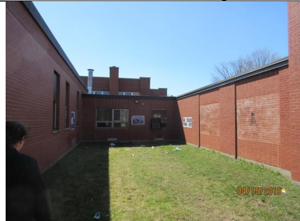
Image 5: Courtyard area between 1954/1958 and 1963 wings of the former school.