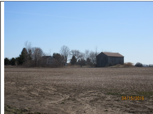
Image 1: View of 5067 Cook Road from Cook Road and Westminster Drive.