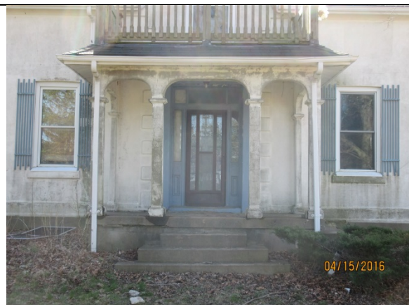
Image 5: Detail of the front entry to the house located at 5067 Cook Road.