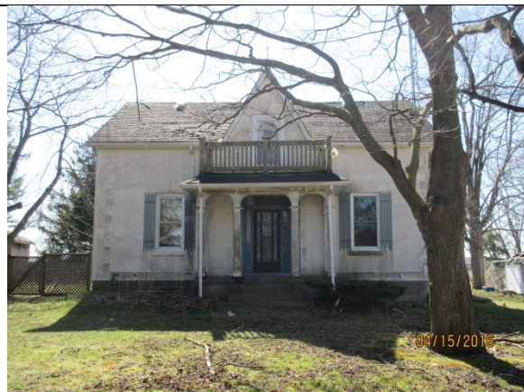
Image 4: Front (east) façade of the house located at 5067 Cook Road.