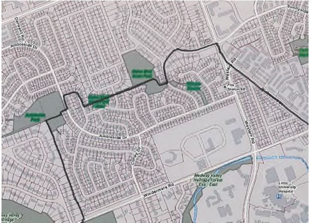
Detail of Ambleside Drive Area