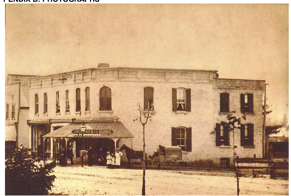
Image 1: 868-872 Dundas Street, circa 1890 ("Building Our Heritage," courtesy of Paul Miller).