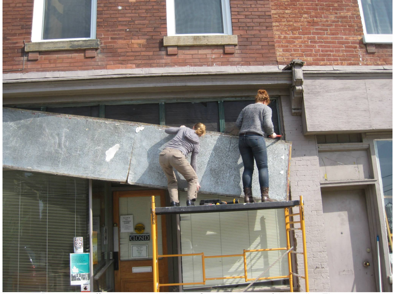
Image 3: Restoration efforts at 864-872 Dundas Street.