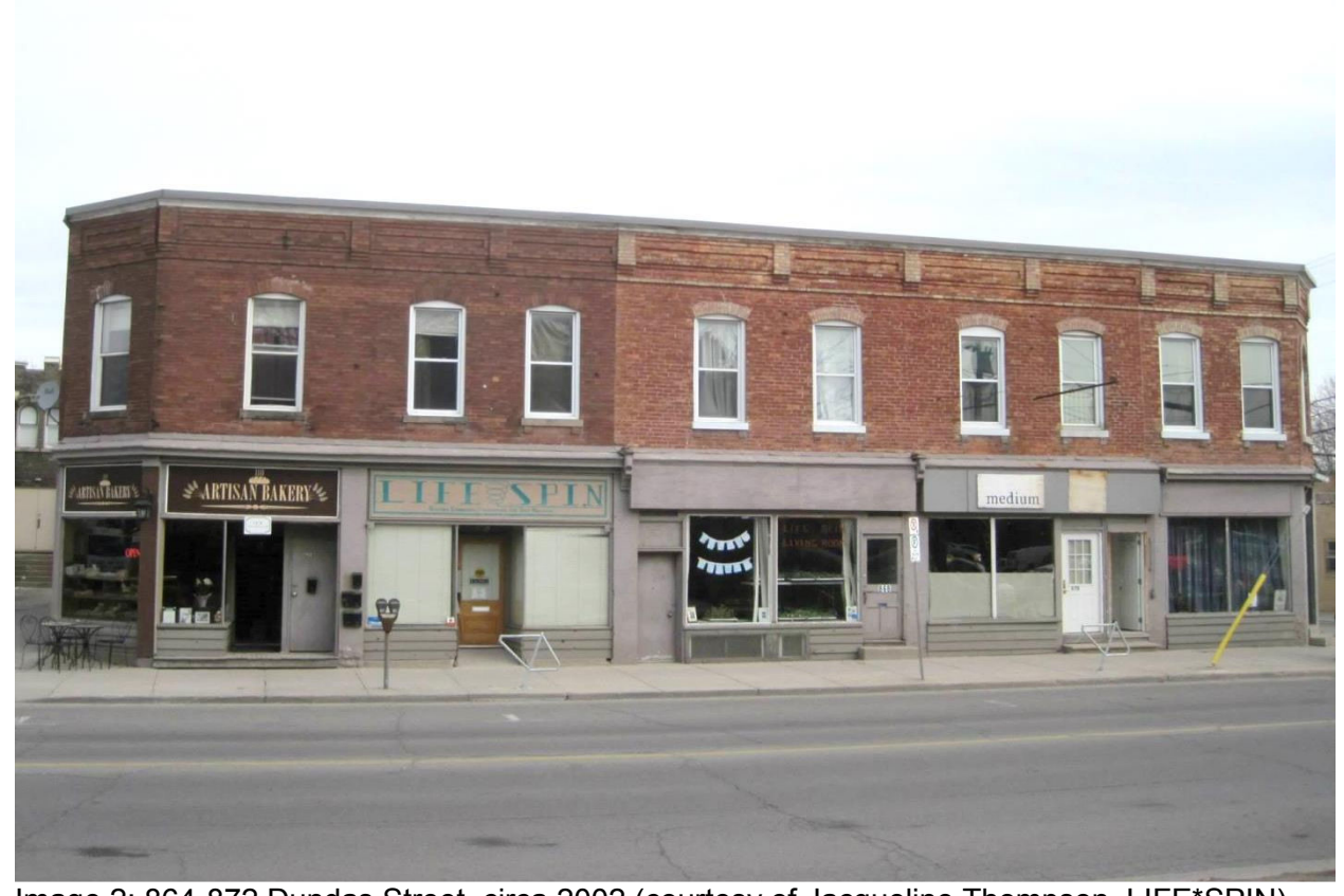
Image 2: 864-872 Dundas Street, circa 2002 (courtesy of Jacqueline Thompson, LIFE*SPIN).