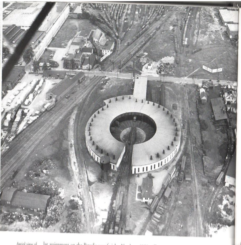
Aerial view of the industrial site in the 1950s, showing the circular structure and rail tracks.