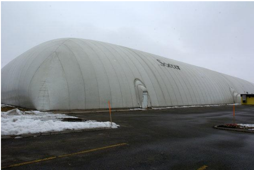
6 Cuddy Blvd – THEN