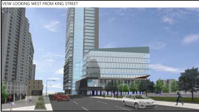
VIEW LOOKING WEST FROM KING STREET