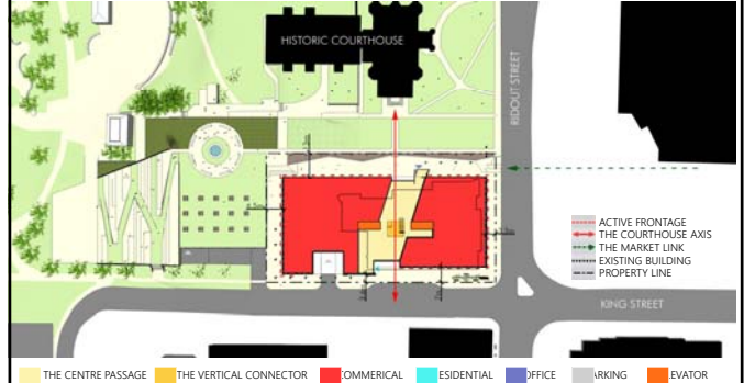
ACTIVE FRONTAGE THE COURTHOUSE AXIS THE MARKET LINK EXISTING BUILDING PROPERTY LINE THE CENTRE PASSAGE THE VERTICAL CONNECTOR COMMERCIAL RESIDENTIAL OFFICE PARKING EVAPORATOR