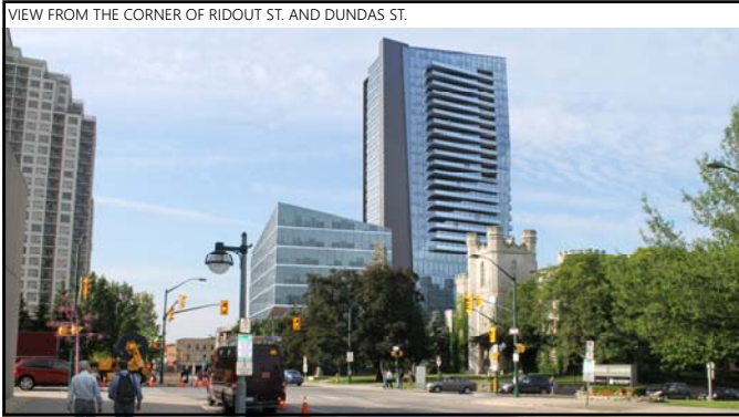
VIEW FROM THE CORNER OF RIDOUT ST. AND DUNDAS ST.