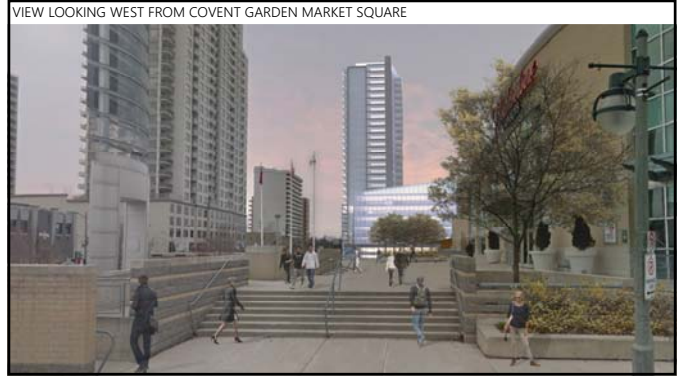
VIEW LOOKING WEST FROM COVENT GARDEN MARKET SQUARE