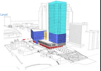
--- COURTHOUSE AXIS CENTRE PASSAGE VERTICAL CONNECTOR COMMERCIAL RESIDENTIAL OFFICE PARKING