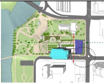
--- COURTHOUSE AXIS CENTRE PASSAGE VERTICAL CONNECTOR COMMERCIAL RESIDENTIAL OFFICE PARKING