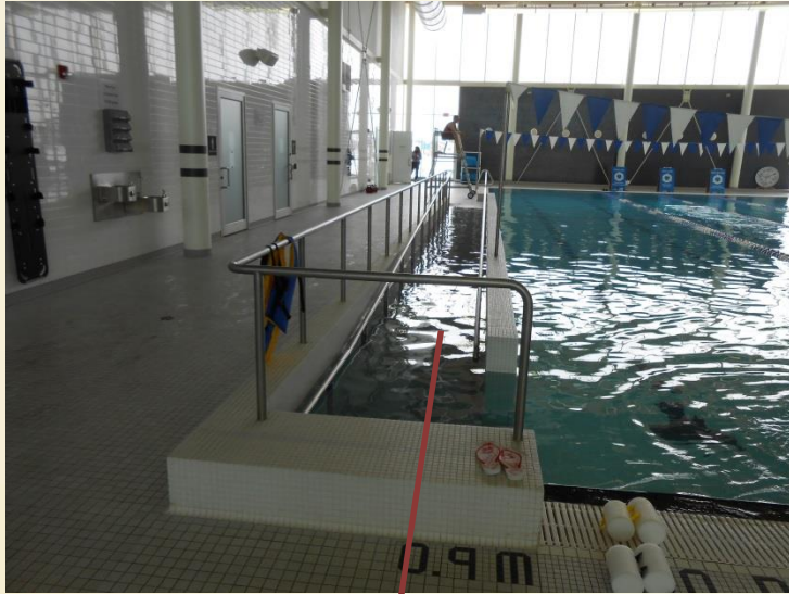
Full ramp pool access