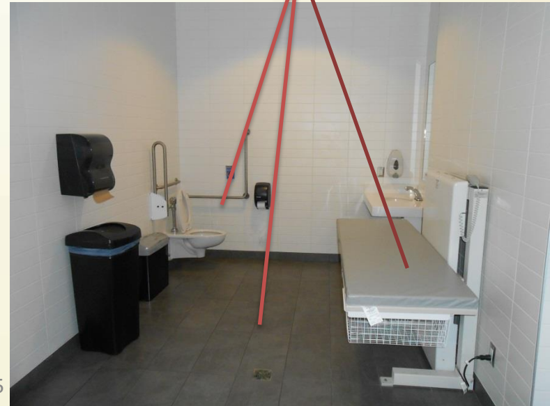
Accessible washroom – large size, grab/transfer bars, adult/child change table