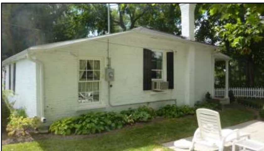
View from North