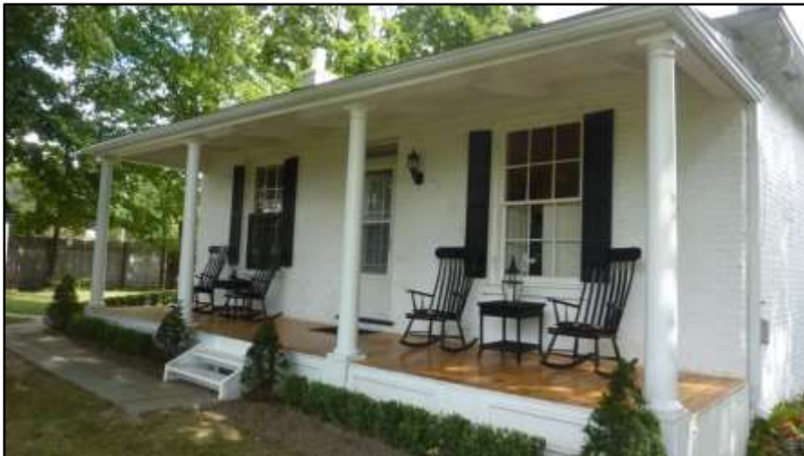
View from west of front facade