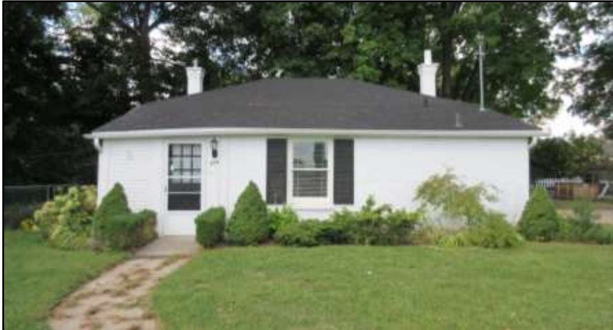
Rear façade-view from Elizabeth Street