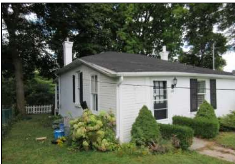
View from south-west