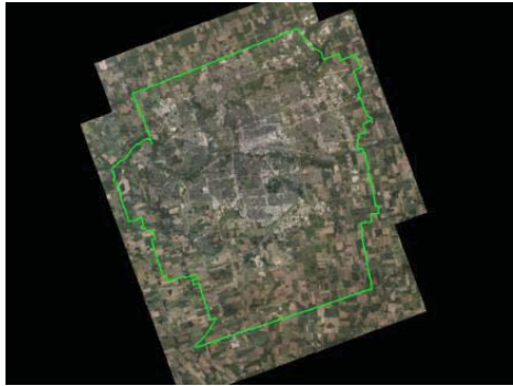
London's Tree Canopy Cover Re-assessment 2015