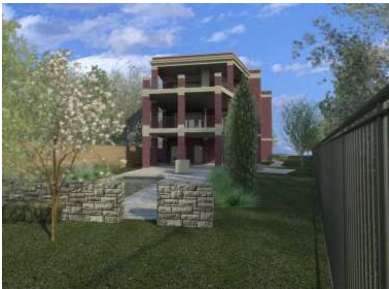
Image 2: Rendering showing rear elevation of the proposed building at 122 Wortley Road (submitted by applicant).