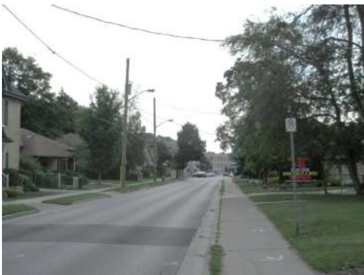
Image 3: Wortley Road streetscape, looking south from Byron Avenue East (August 10, 2015).