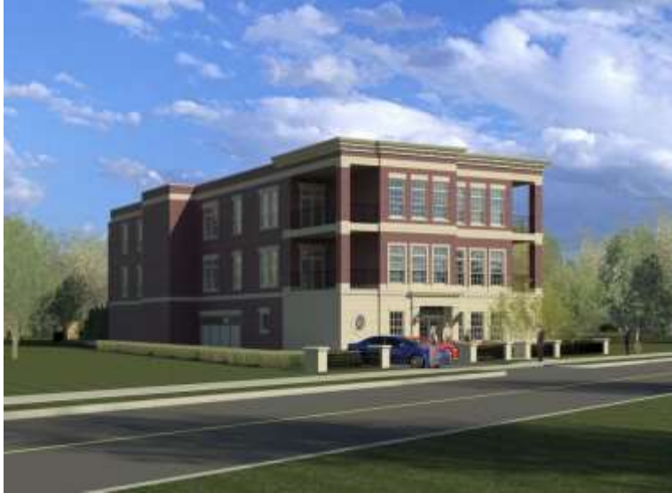
Image 1: View looking southeast of proposed building at 122 Wortley Road (submitted by applicant).