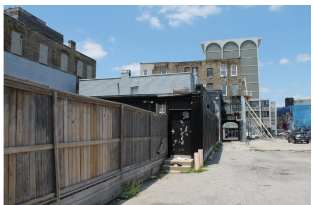
View from south showing multiple building additions above fence