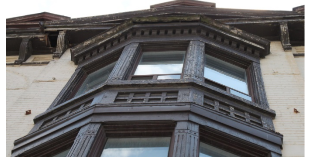
Detail - carved wood-trim bay window