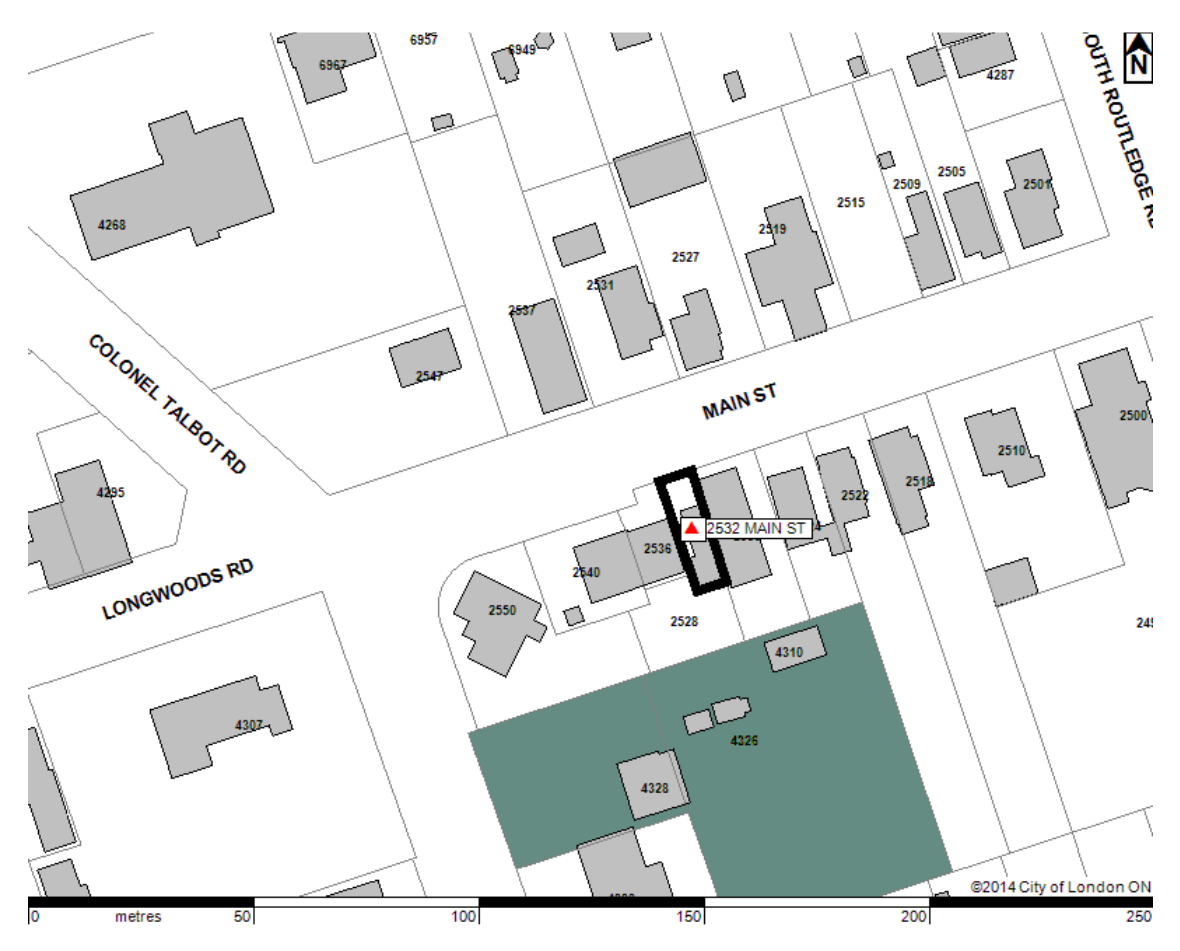
SCHEDULE "A" Part Lot 1 and 2, Plan 443 in the City of London, County of Middlesex