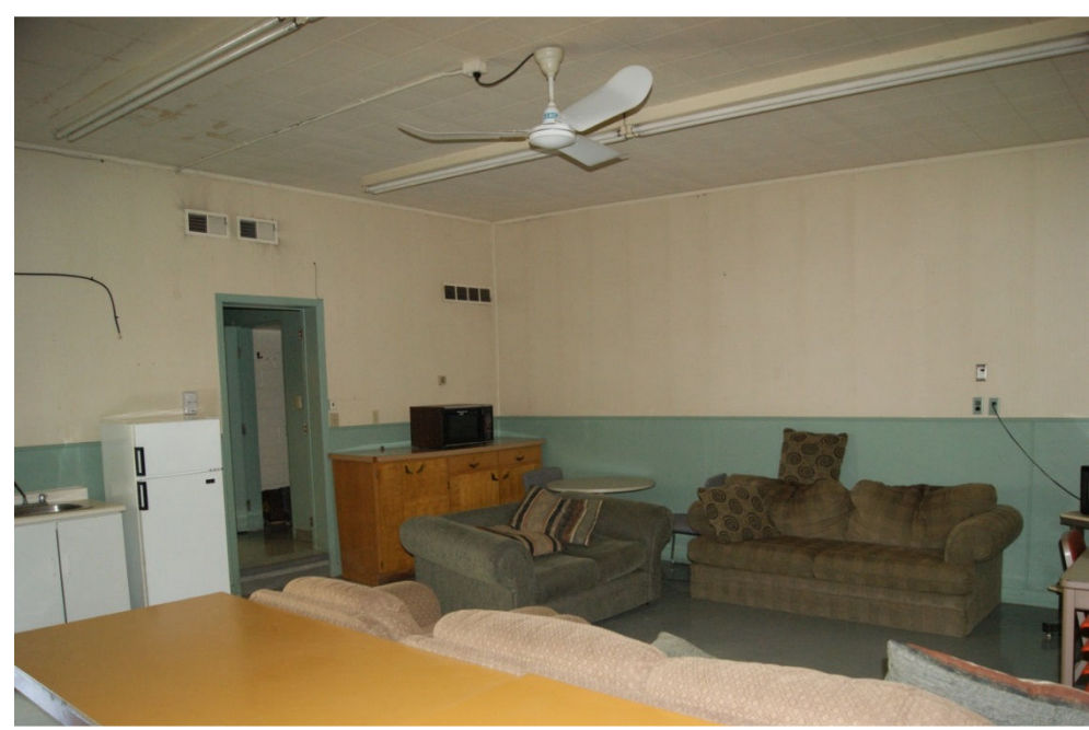
View of Back Room