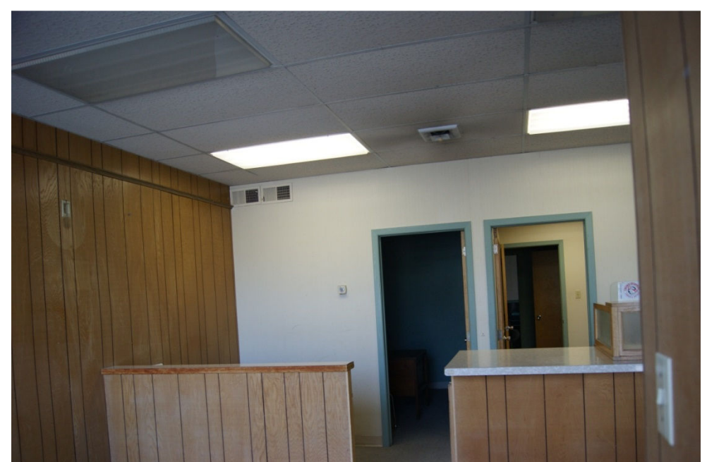
View of Front Room