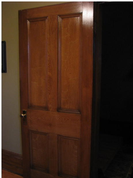
Image 9: Detail of the wood trim noted in the designating by-law (January 28, 2015) (Image courtesy of the property owners).