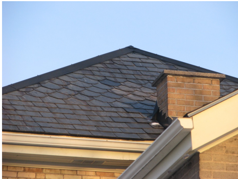
Image 5: Detail of the slate roof (January 28, 2015).