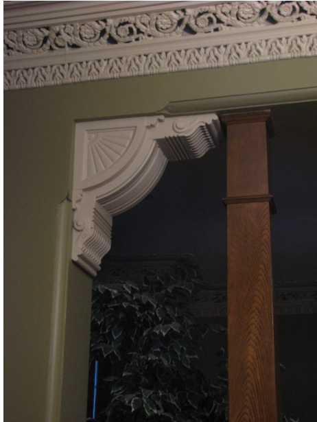
Image 8: Detail of the ornamental plaster work at 77 Price Street (January 28, 2015) (Image courtesy of the property owners).