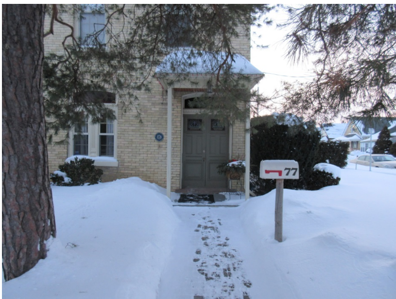
Image 3: Detail of the front door of 77 Price Street (February 25, 2015).