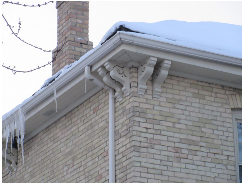
Image 4: Detail of the paired brackets of 77 Price Street (February 25, 2015).