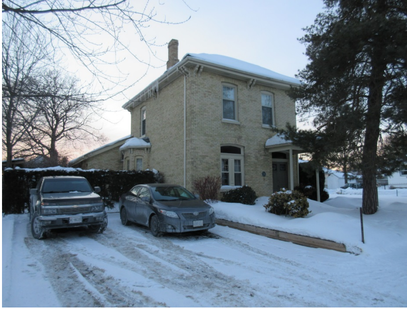
Image 1: View of 77 Price Street showing the Price Street façade (February 25, 2015).