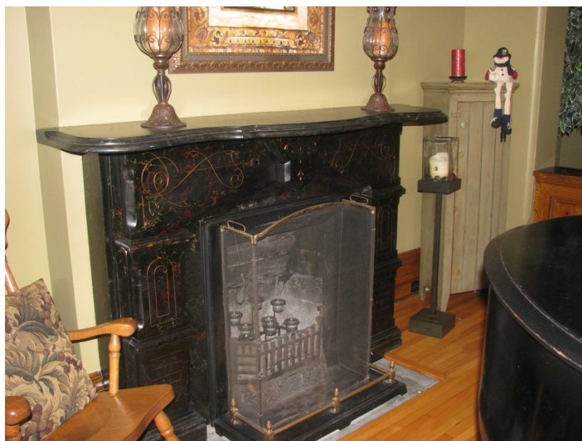
Image 6: The functioning period fireplace, referenced in the designating by-law, at 77 Price Street (January 28, 2015).