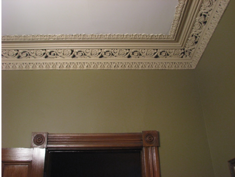
Image 7: Detail of the ornamental plaster work and sample of the wood trim in the double parlour of 77 Price Street (January 28, 2015) (Image courtesy of the property owners).