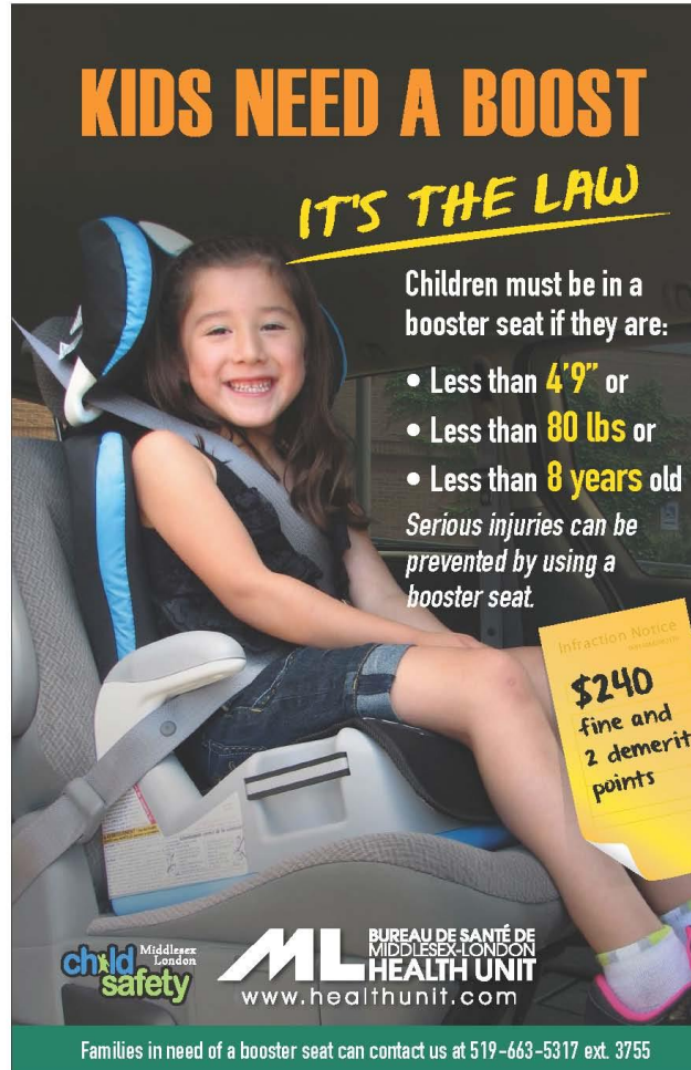
Car Seat Safety – Booster Seat Poster size: 11"x 17"