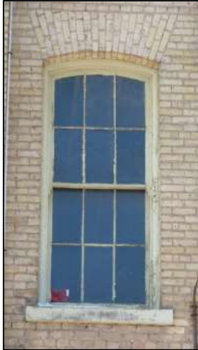
Second floor window (segmented arch)