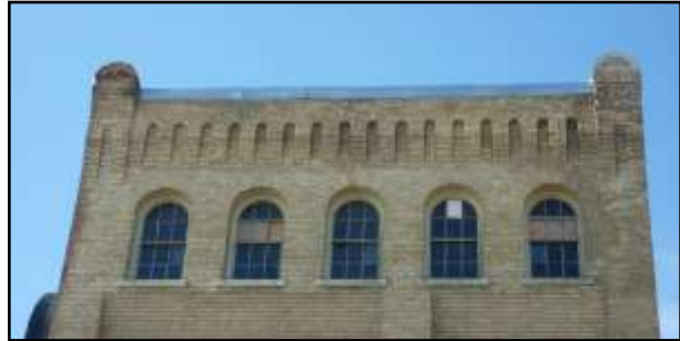
Cornice and top floor windows -South Facade