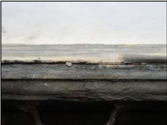
Interior showing exterior window sill