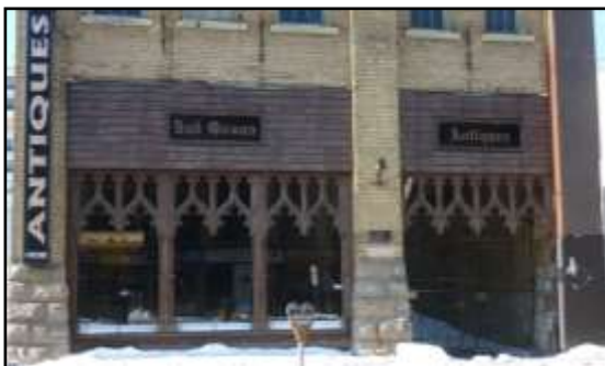
Ground floor retail windows