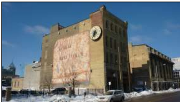
South Façade 0