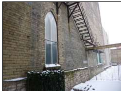
Gothic window on north facade