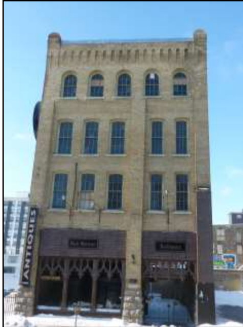
East (Front) Facade