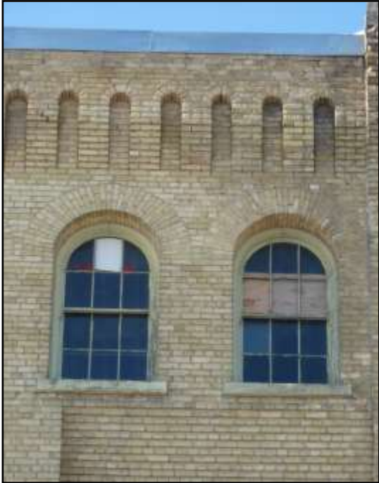
Top floor windows (rounded arch)