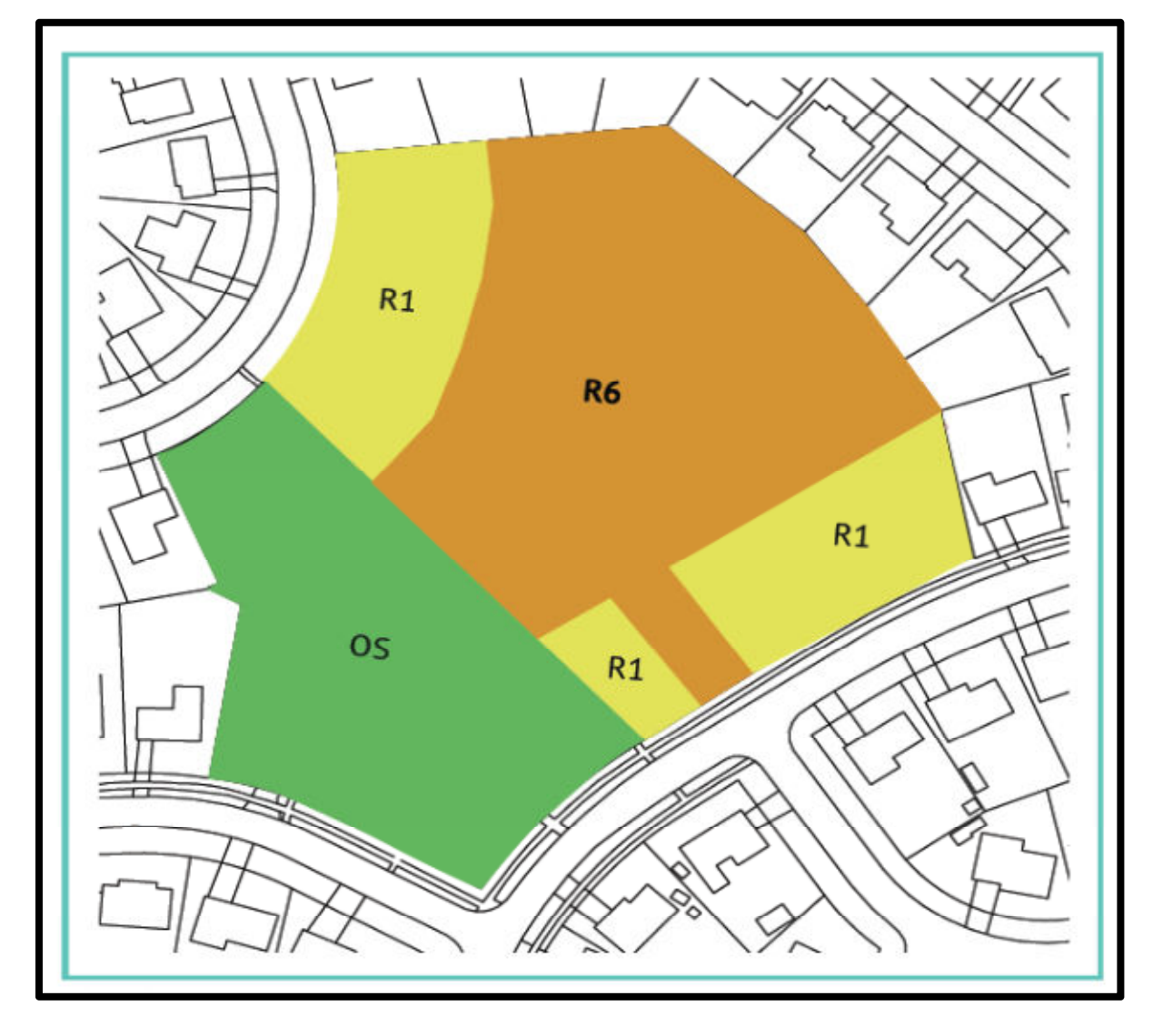
Figure 3 - The Implementing Zones

A Residential R1 (R1) Zone variation was adopted to provide for single detached dwellings fronting Finsbury Crescent and Wychwood Park.