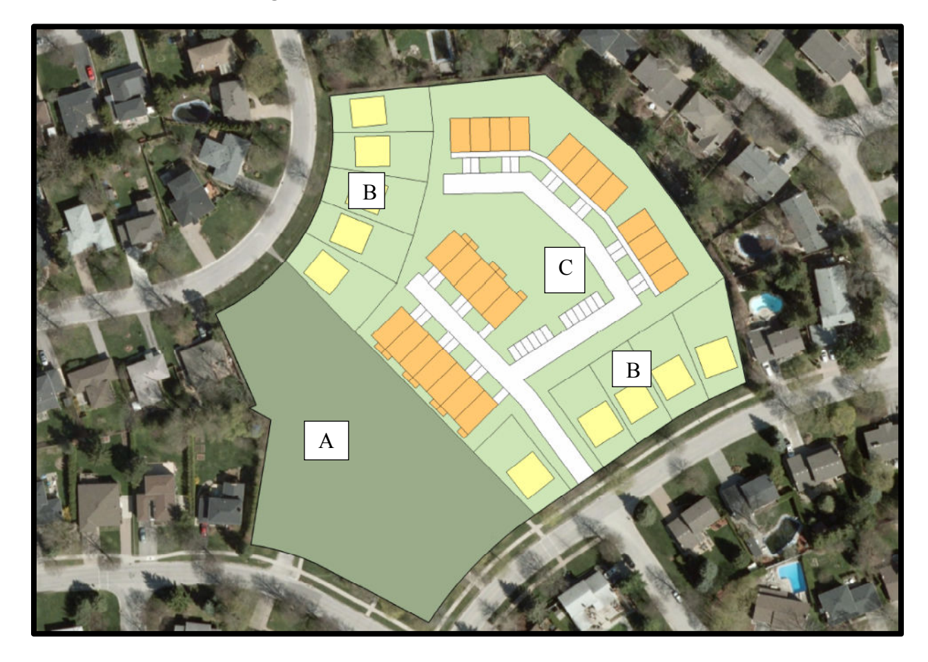
Figure 2 - The Development Concept

The overall residential density of the site is 22.7 units per hectare (or 10.1 units per acre). The goal of this configuration is to buffer the existing single dwellings from the more intense cluster housing block.