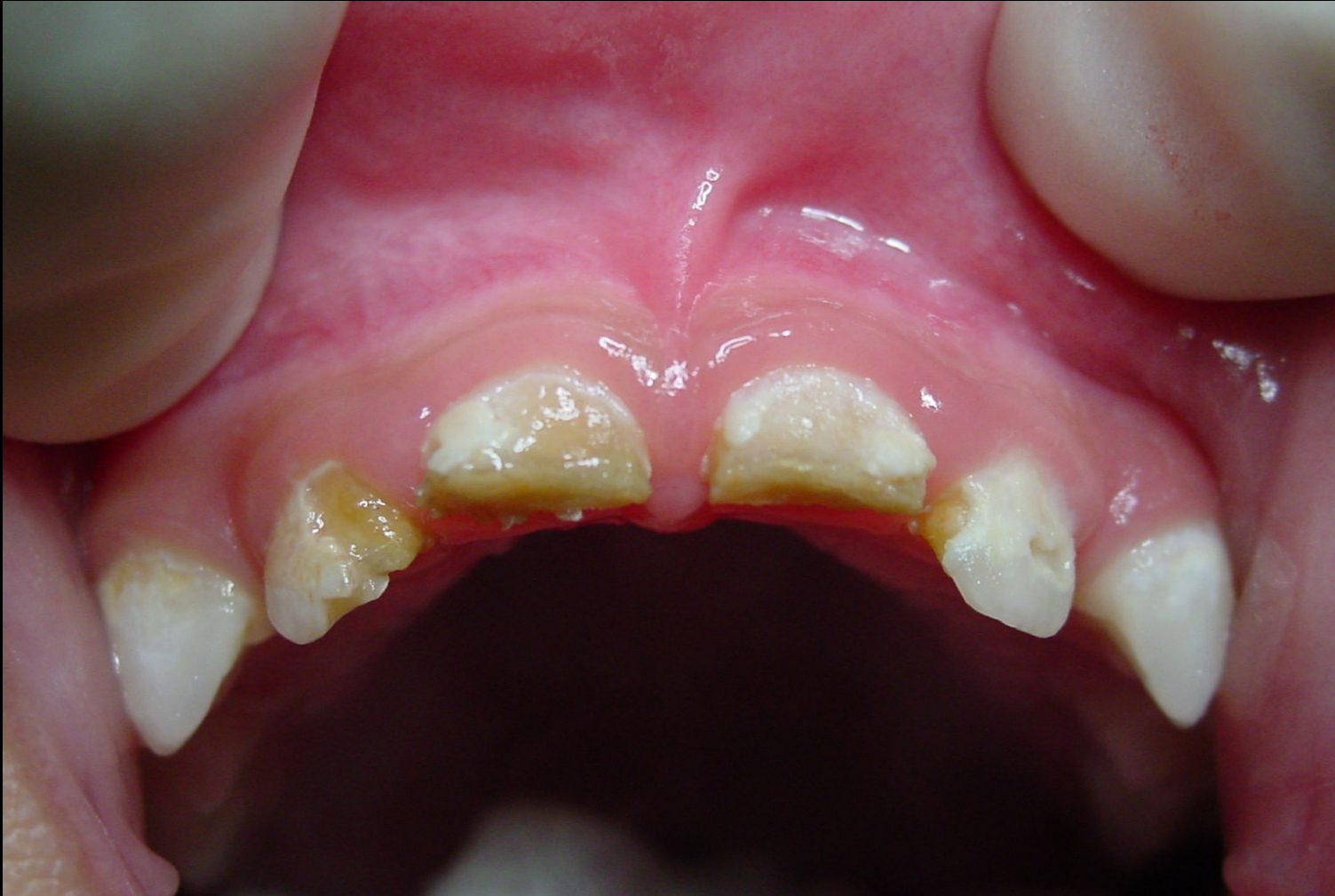
Dental decay in a two-year old