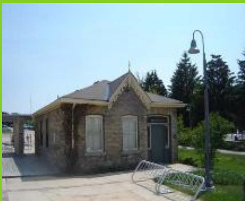
I Dundas Street Built 1880