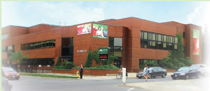
London-Middlesex Health Centre