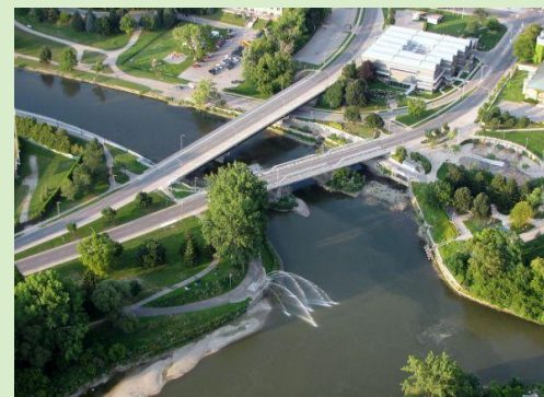
Thames Walking & Bike Paths