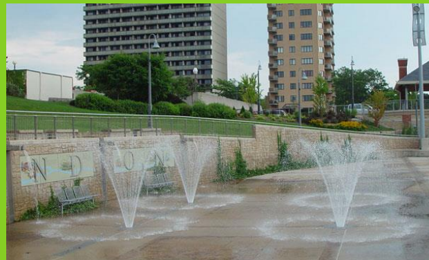
Thames Splash Pad