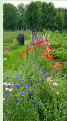
River Forks Community Gardens