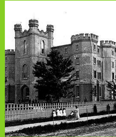
Old Court House