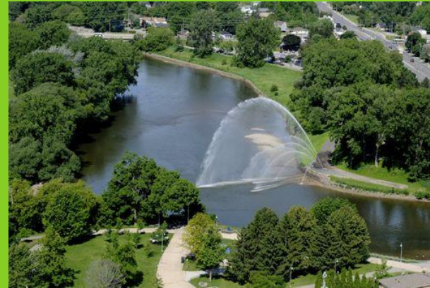
Walter J. Blackburn Memorial Fountain