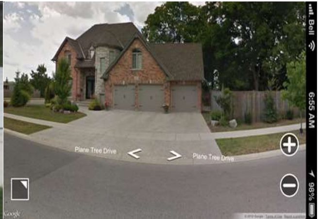
Forced Cut-back of a driveway at street line