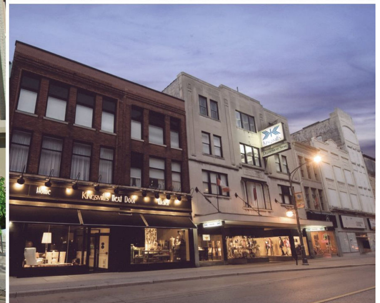
Streetscape - Dundas Street