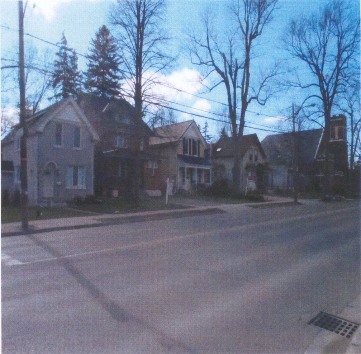
West side of Richmond, looking north, directly across the street from 230 Victoria Street