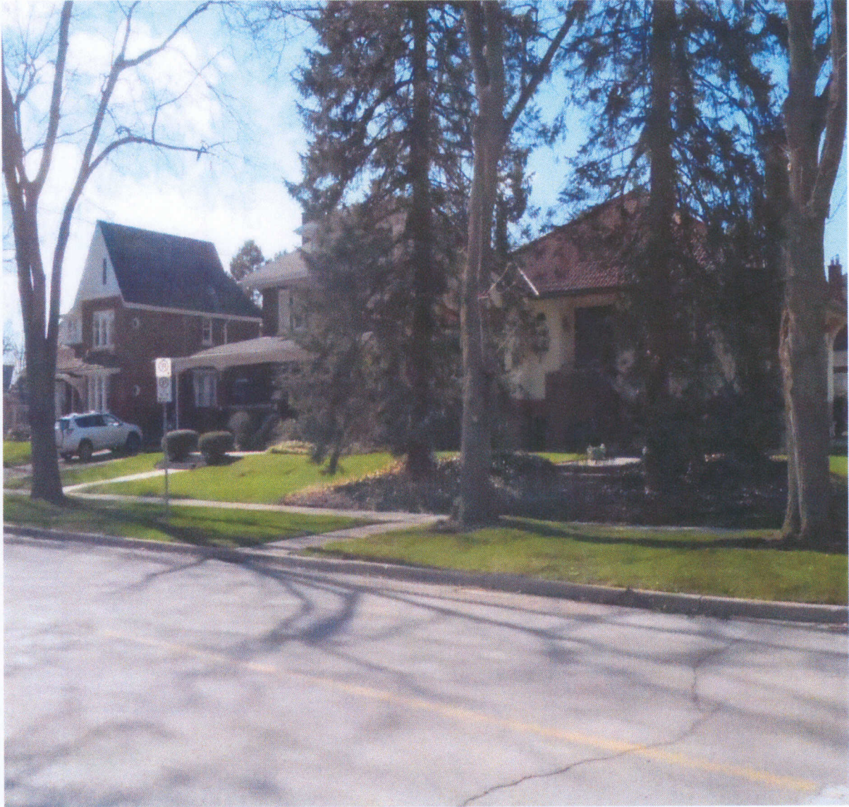
North side of Victoria Street, looking west, 230 Victoria Street is at the left edge of the photo