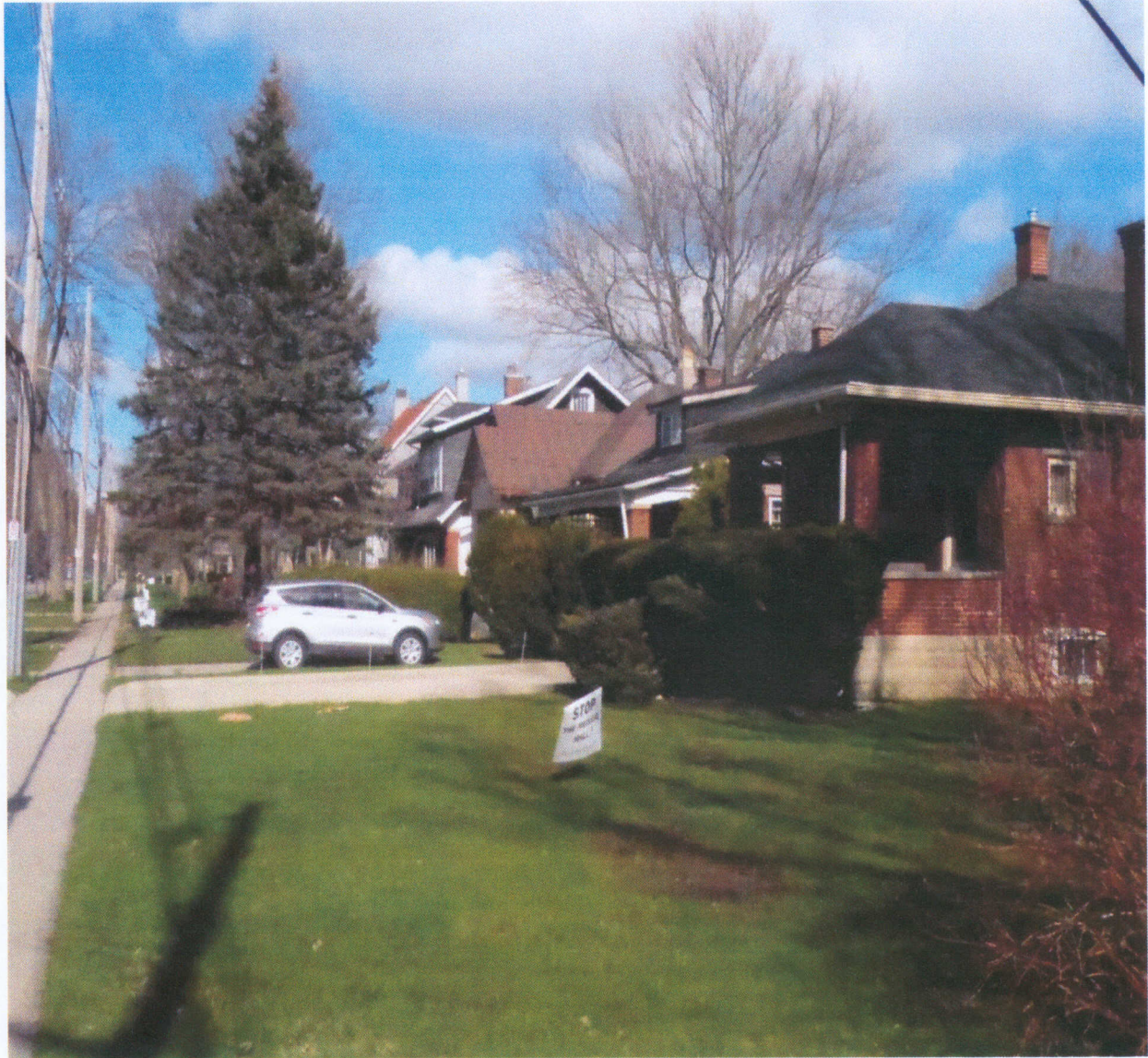
South side of Victoria Street, looking east, directly across the street from 230 Victoria Street