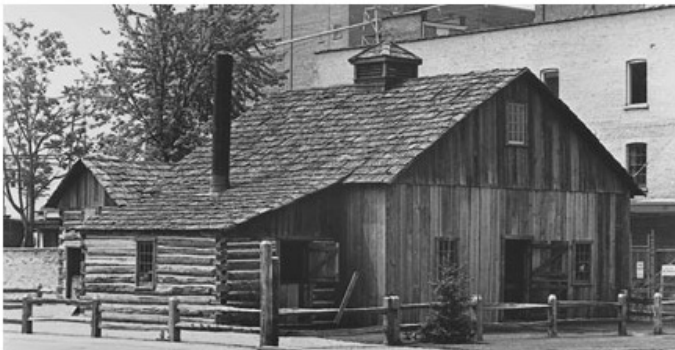
1828 The first Labatt Brewhouse built in 1828