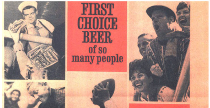
1950 Print advertisements for Labatt Pilsener and Labatt 50

A year later, Labatt launched its Pilsener Lager, setting the trend for lager beers in Canada. When it was introduced in Manitoba, the beer was nicknamed "Blue" for the colour of its label and the company's support of Winnipeg's Canadian Football League (CFL) franchise, the Blue Bombers. The nickname stuck and in 1979, Blue claimed the top spot in the Canadian beer market, a position it has held ever since.