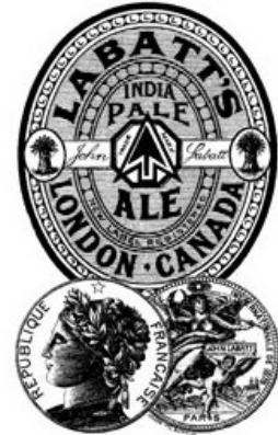
1878 Labatt's India Pale Ale wins a gold medal at the International Exposition in Paris, France.